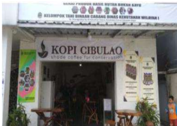
Fig. 1. Community Business World Tugu Utara Bogor

The role of industry and business is the synergy of involvement of the industrial world in terms of developing and standardizing the quality of processed products or the creativity of rural communities. Tugu Utara Village has implemented the role of the business world in the form of Cibulao coffee production. Village communities with coffee farmer groups have succeeded in developing a business activity. The village community already owns the Cibulao coffee shop, which is an outlet for non-timbeorest products originating from farmer groups assisted by the Regional ForestryService branch.