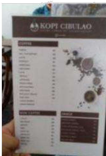
Fig. 2. Community Products at Cibulao coffee shop