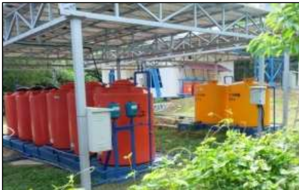
Fig. 2. SWRO Facility in Bintan

The cost required to operate the SWRO, for five hours of operation per day, the cost of chemical drugs to manage saltwater to become fresh is IDR 30 million to IDR40 million per month. Meanwhile, electricity costs around IDR 90 million to IDR 100 million per month. Maintenance costs cannot be budgeted temporarily because of the budget constraints of the Bintan Government. Therefore, the maintenance fee will be charged to the community through the service cost. Two rates will be applied to customers—namely, non-subsidized household rates and subsidized rates. The non-subsidized tariff is IDR 25,760 per cubic, and the subsidized price is IDR 15,500 per cubic.