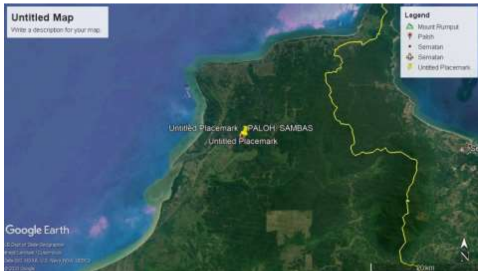
Fig. 1. Paloh sub-district map

Geographically Paloh sub-district is located between 1035 '35 " until 2005 '43' North Latitude and 109038 '56 "to 1090 28 '27" East Longitude. Paloh Subdistrict is located in the north of Sambas Regency which borders directly with Sarawak Country in eastern Malaysia. This sub-district is a coastal area which has the longest coastline in Sambas district. Paloh Subdistrict has an area of 1,148.84 km 2 (114,884 ha) or 17.96 percent of the area of Sambas district [5].