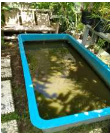
Fig. 4. Catfish Farming

The activity of plants and fish cultivation in Farmer Groups of Bausasran Subdistrict was utilizing empty yards to be used as cultivation sites. Three types of plants cultivated were ornamental, medicinal, and horticultural. Furthermore, catfish and ornamental fish were the types of fish cultivated.