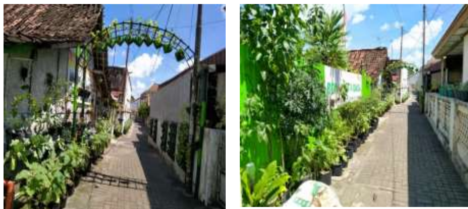
Fig. 3. Vegetable Aisles in Bausasran Subdistrict

In optimizing the use of land, several activities were carried out, including creating nursery gardens, setting up group gardens, and making vegetable aisles. The nursery was created in groups to make it easier to grow vegetable plant. Group garden was a typical garden planted with various vegetable and medicinal plants or herbs.