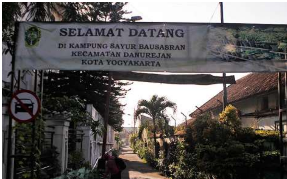
Fig. 2. Kampung Sayur Bausasran

In optimizing the use of land, several activities were carried out, including creating nursery gardens, setting up group gardens, and making vegetable aisles. The nursery was created in groups to make it easier to grow vegetable plant. Group garden was a typical garden planted with various vegetable and medicinal plants or herbs.