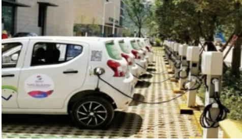
Fig7. Charging pile layout should be early, fast and reasonable

New public parking lots, office buildings, shopping malls, hotels and other public construction projects should be set with charging piles, which should not be less than 20% of the total planned parking space.