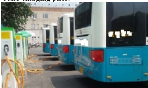
Fig4. Charging pile group at bus stop

Public parking lots, transfer parking lots, expressway service areas, transportation hubs, large station parking lots to build charging piles.