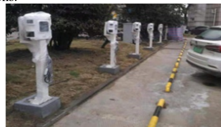
Fig5. Yongqing AC charging pile in Bengbu, Anhui

The proportion of allocation shall be clearly defined. The planning and land administration departments shall specify the charging pile configuration requirements for new public construction projects, residential communities and social public parking lots in the land transfer conditions.