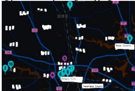
Fig3. Distribution of large shopping and commercial centers in Bengbu City

Charging piles are set up in large shopping malls.