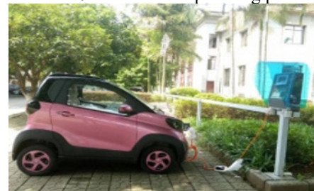
Fig6. Charging pile of Bengbu community

The proportion of parking spaces for newly-built residential quarters (including affordable housing) should not be less than 10% of the total planning parking spaces.