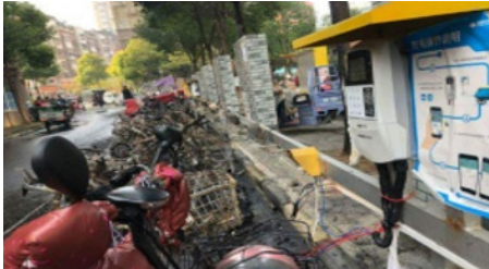
Fig8. Public charging pile at the north side of Building 10, Jinding Huangzhuang Phase II, Huangzhuang Street, Bangshan District, Bengbu City

The proportion of charging pile construction shall not be less than 5% of the planned total parking space when the old residential area is renovated.