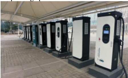
Fig9. Reasonably advanced construction, accompanied by vehicle piles, intelligently and efficiently optimized construction layout of EV charging facilities

The proportion of Party and government organs, institutions, enterprises and institutions that meet the requirements shall not be less than 10% of the total number of parking spaces.