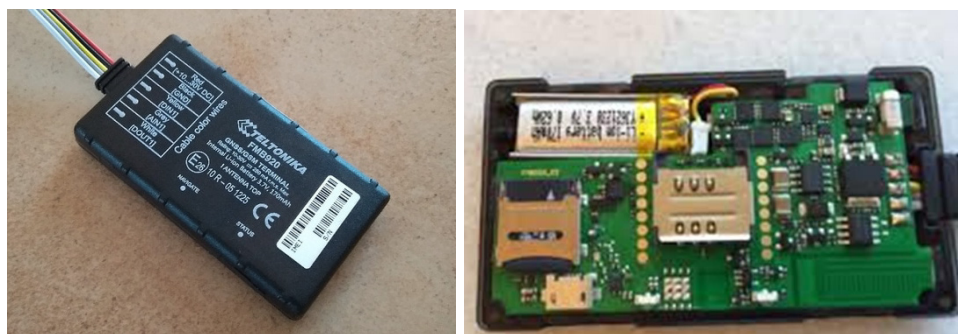
Fig. 2. GPS receiver Teltonika FMB920 installed in combine Dominator-130.