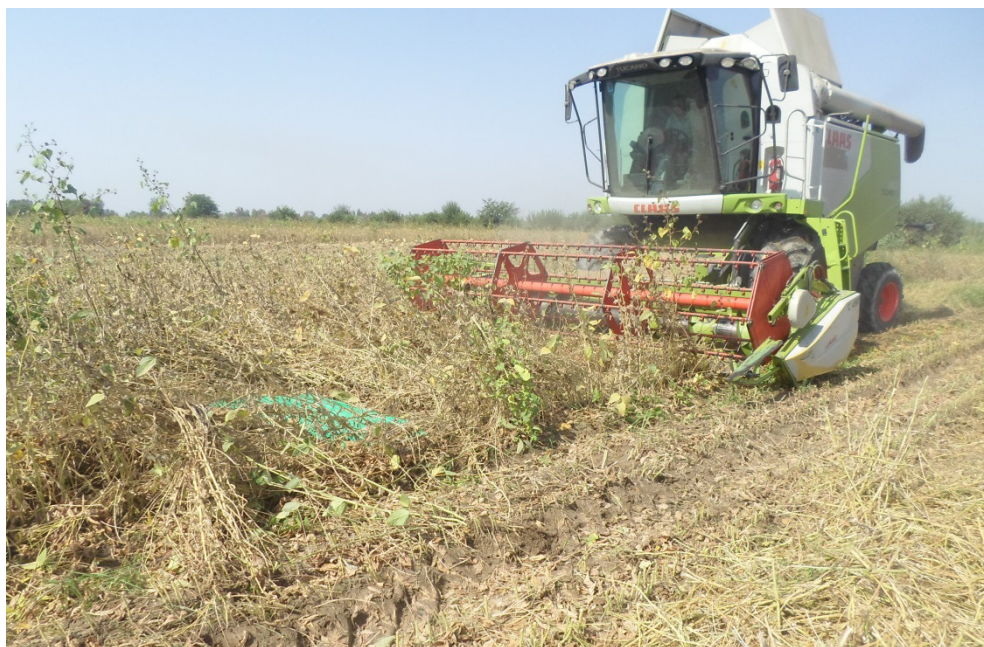
Fig. 1. Process of harvesting soybean with combine Dominator-130.

After defining the harvesting condition in the field where combine works, it was started to harvest the soybean (fig.1) and according to research method its work quality indicators were defined.