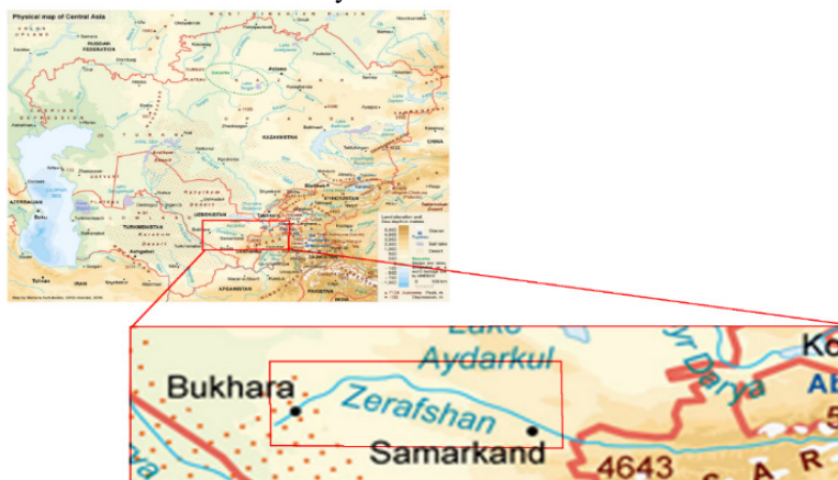
Fig. 1. Middle and lower part of the Zarafshan river basin

The object of study is the soil geosystems of the Zarafshan valley. The Zarafshan valley is characterized by a high natural discharge dynamic [5]. in the mountainous upper part located Tajikistan. Middle and lower part located Uzbekistan (Fig 1). The research objective is to study the spatial differentiation of salts in soils within the geosystems of the Zarafshan river valley.