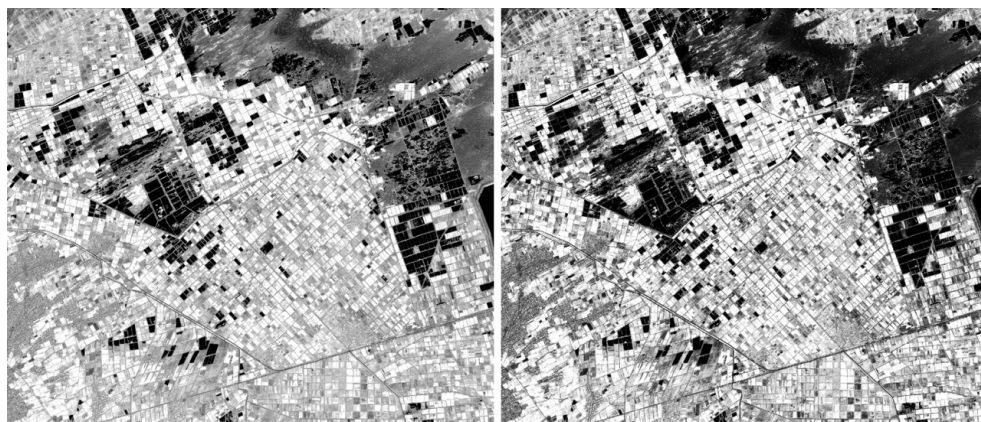
Fig. 3. Sentinel-2 snapshot fragment (8th spectral channel) before (left) and after (right) linear alignment

Images selected for the study were prepared for thematic mapping by atmospheric and linear correction, as well as geometric alignment (Fig. 3).