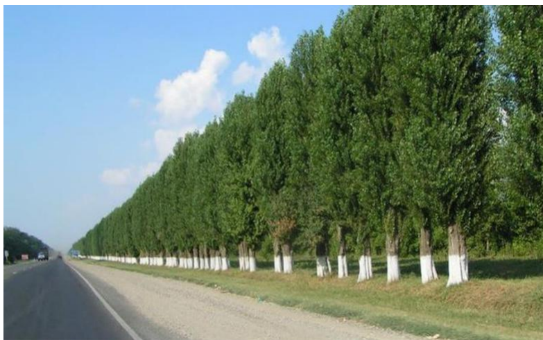
Fig. 1. Caption of the Figure 1. Below the figure.

The coordinates of each test site were recorded using a GPS receiver. The information received was entered to the account sheet a (Table 1).