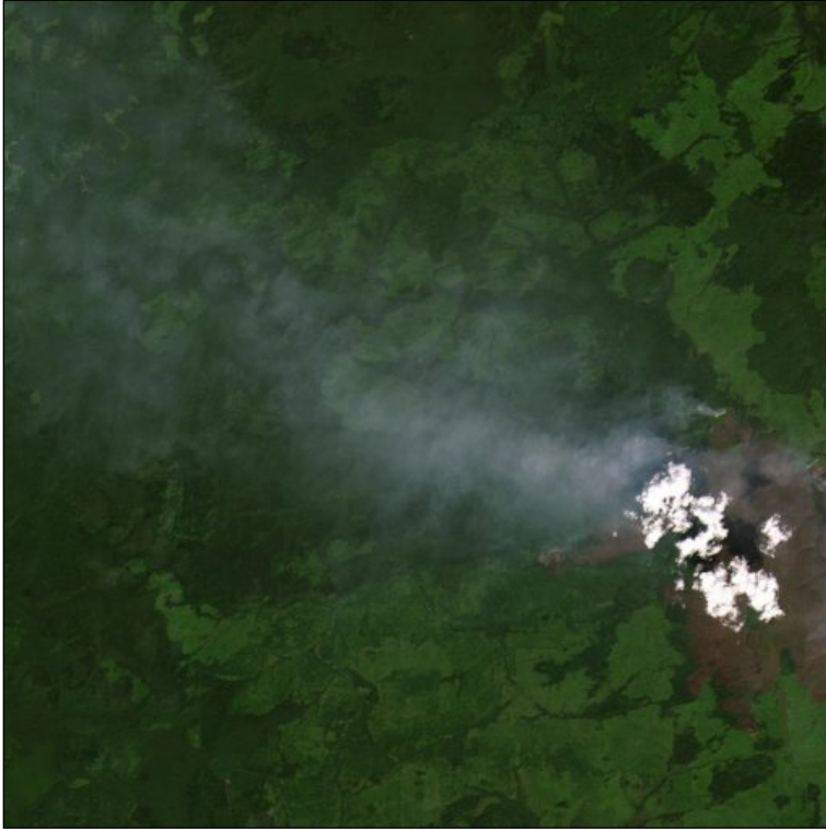
Fig. 1. Surface snapshot with smoke

For the convenience of calculations, let us set the size of the investigated area as a power of two: 512 * 512 pixels (the use of the Fourier transform of two-dimensional signals with a number of samples other than a power of two is described in [5-6]). This image can be represented as a function f(x,y) of the brightness of a pixel with coordinates x and y , taking integer values 0-255 for each red, green, blue channel in the RGB color model.