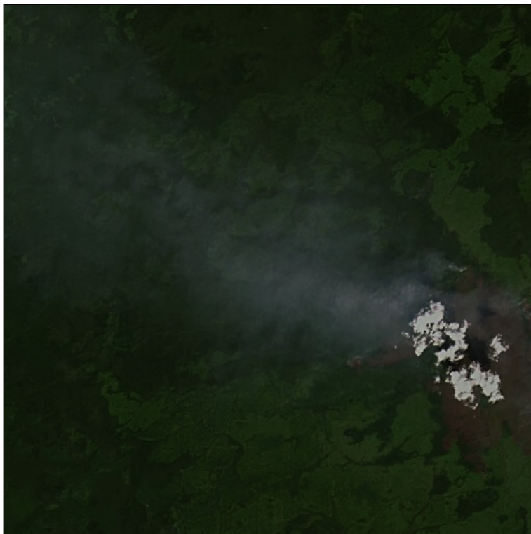
Fig. 4. Global high pass filtering result

Now let's combine the obtained filtering result with the original image. The final result of digital processing is shown in Figure 4.