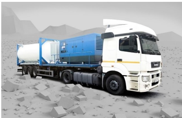
Fig. 2. Mobile LNG-power complex.

The mobile energy complex MEC-LNG-125/800 with a capacity of 125 kW and a cost of 18 million rubles can be used as a GGU. [12]. The appearance of the complex is shown in Fig. 2.