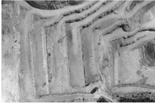
Fig2. Orthophoto map