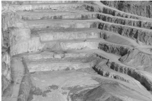
Fig3. 3D real scene model