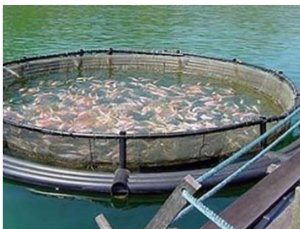
Fig. 2. Fish cages.

Gardens are arbitrary, but often they are rectangular or trapezoidal "bags" that hang freely directly into the water, consisting of a net (fig.2).