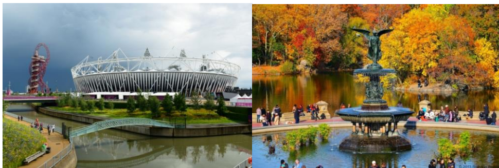
Fig. 9. Left: Queen Elizabeth Olympic park (UK), right: Park Fall Wallpaper (Central Park, New York, USA).

An industrial zone used to be located on the area of Queen Elizabeth Olympic park, which previously led to severe pollution of the atmosphere, water resources and soils of the adjacent territories. Therefore, before the establishment of the park, significant work was previously carried out to clean up soil and water using modern technologies.