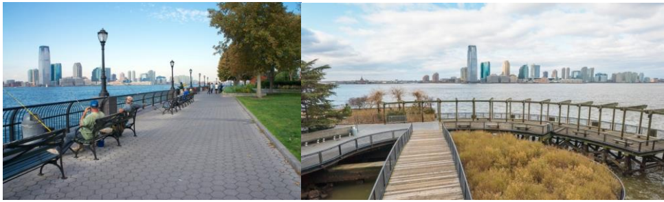
Fig. 8. Embankments of New York.

If we talk about parks, the main condition for their successful existence and popularity lies in the diversity of their surroundings, their location in the urban fabric. The park is an ensemble, on the correct arrangement of which it depends whether it will turn into an empty alienated zone or it will become a prosperous place for the citizens to spend their time.