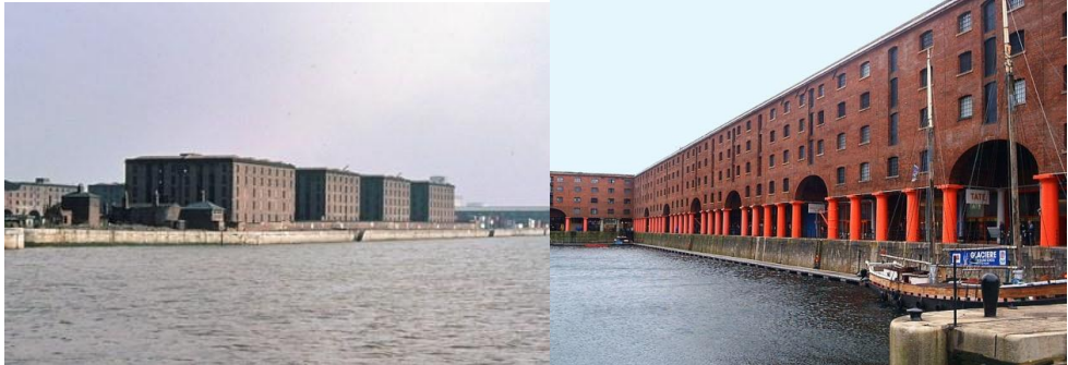
Fig. 4. Albert Dock in Liverpool (UK): left - 1979, right – today.

Europe, and it was also included in the five most popular cities for buying real estate in the UK.