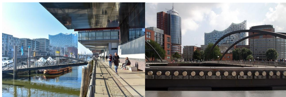
Fig. 3. Hanseatic Trade Center (Hafencity, Hamburg).

New hotels, shops, office and residential buildings appeared on the restored territory (Fig. 3). The construction of buildings was carried out using new construction technologies aimed at maximizing the preservation of the environment.