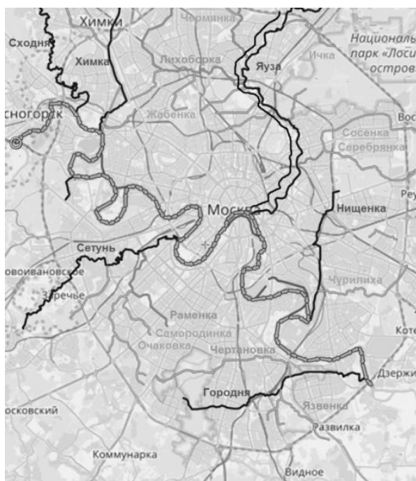
Fig. 5. Fragment of the hydrographic network of Moscow.

Therefore, we will assume that it is water bodies that largely form the framework of the city (Fig. 5) and ensure the integrity of the urban planning natural-man-made system as a whole (including the water and natural systems of the city).