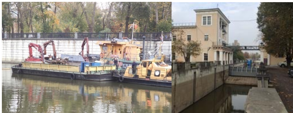
Fig. 6. Yauza river embankment.

Since it is objectively impossible to ensure the conditions for the existence of a water body on the territory of a city as in undisturbed nature, the term ‘nature-friendly state’ has appeared in the special literature in relation to urban water bodies, which is used in the development of projects for the recreation, reconstruction, repair and operation of urban water bodies. They live a peculiar life and require special conditions for survival. Urban water bodies must be exploited, i.e. in contrast to natural conditions, when the existence of a water body is provided by nature itself, in conditions when the existence of an urban water body must be ensured by a person, since the water body itself is not able to cope with technical transformations and the amount of pollution that come from the urban area [11].