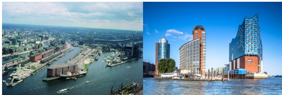
Fig. 2. Hafencity Hamburg (Hamburg, Germany). Left: early 90s, right – 2013.

Nowadays, the construction of large residential, business, public and recreational complexes on the coastal areas and adjacent territories with the inclusion of a water body as a central component of the overall composition has already begun actively. Such territories have undeniable architectural and landscape merits, which make it possible to implement unique projects with their own artistic characteristics. These projects include the Red October factory complex in Moscow, the Albert Dock in Liverpool (Great Britain), the Quai Branly Museum in Paris (France), the Hafencity district in Hamburg (Germany) (Fig. 2).