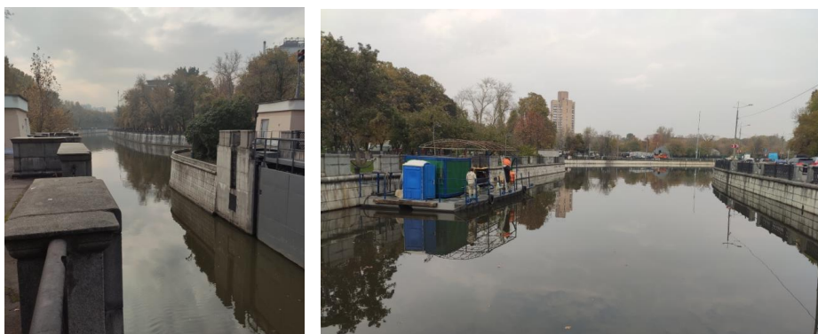
Fig. 7. Yauza river.

Almost 1/3 of the territories adjacent to the Moskva River are impenetrable, i.e. there is no way through them to approach the river by car or by foot. These are the industrial areas, public areas with limited access. The same processes especially affected the coastal areas and embankments of the Yauza River, potentially rich in relief and landscape. Almost all coastal areas and sections of the Moscow River and Yauza (as well as other small rivers in the middle and outskirts of the city) have become inaccessible to pedestrian traffic.