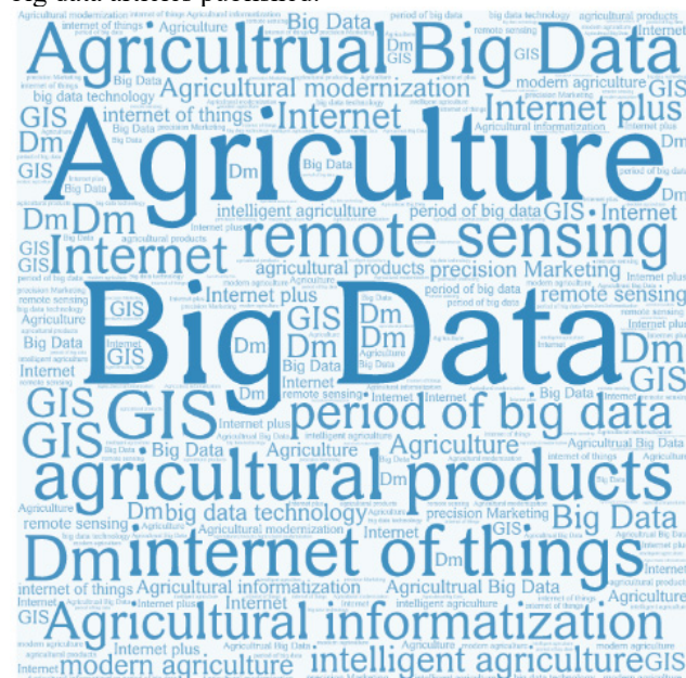
Figure 2 Key words of agricultural big data in the latest ten years b. From the Wanfang database

Through the data retrieval of Wanfang database, the published literature of agricultural big data in the latest ten years are retrieved, and the results are shown in Figure 1. From 2010 to 2019, the published literature of agricultural big data showed an overall upward trend, reaching the highest point in 2018, with 209 agricultural big data articles published.