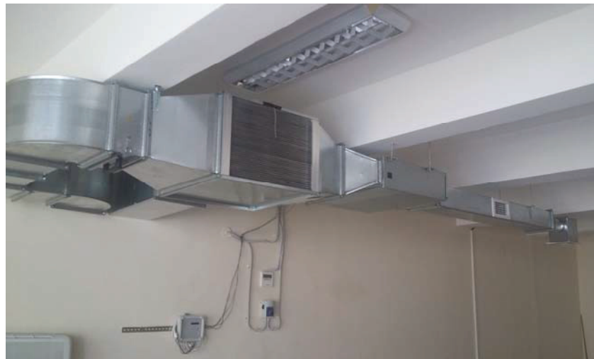
Fig. 2. General appearance of air handling unit [2]

General appearance of air handling unit are shown in Figure 2.