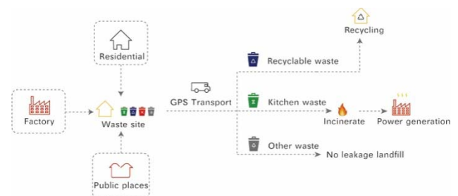
Fig.1. Flow chart of garbage disposal.

Build a smart waste treatment station to intelligently classify and treat the hazardous waste and environmentally polluted waste that can be treated with the recycling value of waste. For example, composting technology separates organic waste from inorganic waste, and organic waste generates organic fertilizer for reuse, inorganic Waste is converted into energy for power generation and heating through incineration. If the rest of the waste cannot be treated with the above technology, then the waste is treated with non-permeable landfill technology. [9] The specific process is as shown in (see Fig.1).