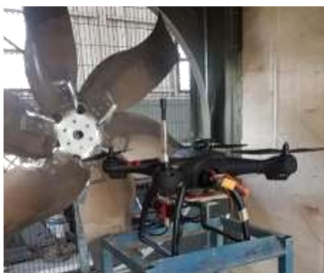
Fig. 6. Complete prototype of anemometer quadcopter surveyor drone.

This data recording remote control receiver for data retrieval control, requires a voltage of 5 V and is taken from the drone battery after being reduced from 11.1 V to 5 V using a DC regulator.