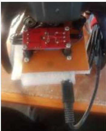
Fig. 5. Radio receiver added to anemometer for precise time data recording.

This data recording remote control receiver for data retrieval control, requires a voltage of 5 V and is taken from the drone battery after being reduced from 11.1 V to 5 V using a DC regulator.