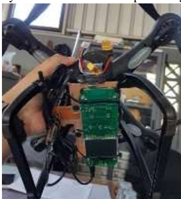
Fig. 3. Integrated anemometer below the drone.

For anemometer power supply users can get the power from drone battery. This process can save a weight of the prototype. Because the differences between the drone battery voltage output and current are different from anemometer Input voltage, users cannot just connect cable from drone battery to anemometer battery. The drone battery is 12 V and the anemometer battery is only 6 V. Users must add some resistor to compliance the problem. In this prototype, reserachers use a regulator to step down the voltage from 11.1 V output from drone battery to 9 V for anemometer input voltage. This process success step down the voltage of the drone battery to safe anemometer input voltage.