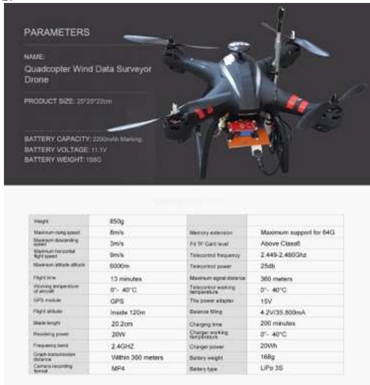
Fig. 2. Quadcopter parameters.

From preliminary flight testing, researchers found the battery life to be roughly 10 min in low-wind conditions, allowing enough time for data collection. However, the battery life is subject to change based upon wind condition and flight plan. Currently, the copter is controlled by remote with a feature to turn back home and following the pilot with usage of GPS.