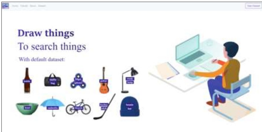
Fig. 2. Interface of the sketch-based image retrieval (SBIR).

Sketch images used for testing are a drawn sketch of the image that you want to search. The number of retrieved images used in the test is 10 images, taken from the top 10 images from the retrieval results. Figure 2 is interface of the sketch based image retrieval that can try on the website. Figure 3 is the retrieval result after user draw umbrella sketch image.