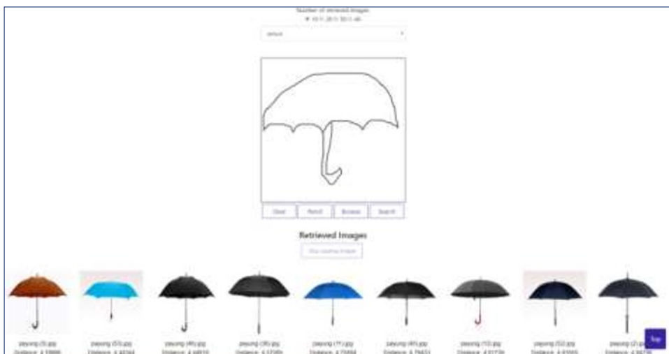
Fig. 3. Result of umbrella sketch-based retrieval.