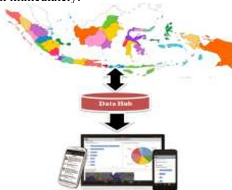
Fig. 1. Energy security dashboard monitoring system concept [7]