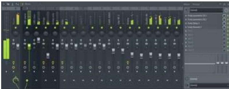
Fig. 6. Mixer controlling each track parameters.

Audio mixing is the process of combining audio, MIDI and effects tracks into a pleasing form that makes use of such as the relative level, spatial positioning, equalization, and effects processing [10]. Figure 6 shows a mixer on FL Studio 20. The mixer feature is the main tool in audio mixing to control all instruments. After each instrument is arranged in a playlist, each track parameter in the playlist can be set using the mixer.