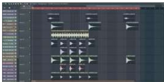
Fig. 4. Percussion is arranged in such a way as to form a rhythm to accomplish other instruments.

The red arrow shows how its velocity can adjust the arrangement of the tones. The settings on the velocity aim to give harmony to the instrument so that the various instruments do not stand out and overlap. Therefore, the velocity on each instrument needs to be adjusted so that the mixing of the music can be more harmonious. For non-pitched instruments, percussion is consists of instruments obtained from the orchestral library sample pack, which is recorded directly and then arranged in such a way as to fulfil our desires. There are crashes, low hits, cinematic drums, rolling toms, double hits, and deep impact sound effects. Figure 4 below shows percussion arrangements in a playlist.