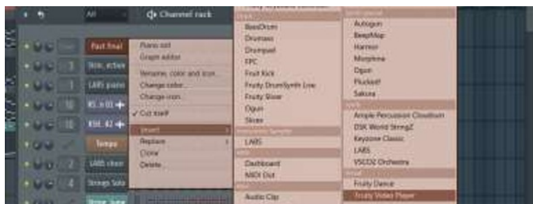
Fig. 1. Instruments input in channel rack.

The first thing to do in this process is to input each instrument that will be used and the visual of film into FL Studio, which will be used as a reference for the music score. Figure 1 below shows the way to input instruments in the channel rack; a section list that contains instruments, sounds and automation used in a track [9].