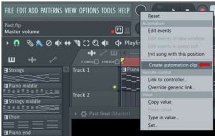
Fig. 7. Creating automation by right-clicking a parameter.