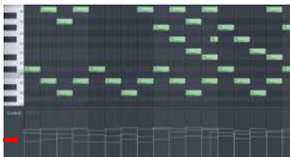
Fig. 3. Piano roll used to draw melodies and chords.

For melodic instruments, a piano roll is used to compose tones that will be displayed throughout the scene [9]. The following Figure 3 shows the example of the piano instrument pattern made in a piano roll.