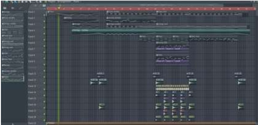
Fig. 5. Playlist; a place where tracks are united by dragging patterns that have been made to form musical unity [9].

After all the instrument patterns are complete, all patterns are arranged in a playlist regarding scenes in the film so that they can create an atmosphere in the film. The following Figure 5 shows all the instrument patterns that have been compiled to form new music.