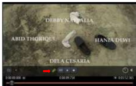
Fig. 2. Fruity video player playing the film.

Figure 2 shows how a film is displayed in FL Studio after being included in the fruity video player. The film on the fruity video player can be set to run according to the time mark on the playlist by clicking on the green chain icon in the fruity video player as shown in the following Figure 2, so the film can go hand in hand with the music arranged in the playlist later.