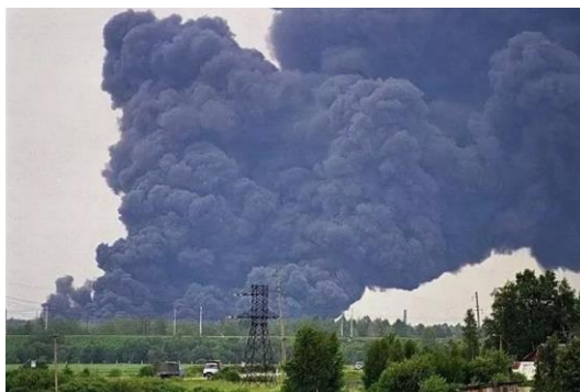
Fig. 2. Fire at "Krasny Bor" landfill site in 2014.

of wastewater, industrial wastewater and waste in rock formations". In 2012 the suitability of the landfill site, though it has been already unfit for use by 100%, was proven by I.V. Buldakov, the dean of geological department in his expert conclusion. Despite the extreme danger of the landfill site for eco-system and health of the people, the state structures (research institutes of hygiene, industrial pathology and human ecology, etc.) have characterized this place as the site meeting hygienic requirements to neutralization of production and consumption waste. In general, waste with high permeability has brought about contamination of lithosphere and hydrosphere, while harmful vapors have contaminated atmosphere of the surrounding territory [23]. The fires outbreaking repeatedly with emission of dangerous combustion products have just aggravated the grave negative situation and created even greater threat for vital functions of population of Tosnensky district, increased a risk of emergence of a disaster (Fig. 2).