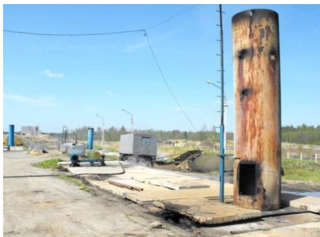
Fig. 3. Waste-to-energy installation at “Krasny Bor” landfill site, 2010.

Totally, around 2 mn t of industrial waste of different class of danger has been brought all together to the landfill site of 70 pits, including 700 thsd t of liquid and pastelike toxic waste with extremely unpredictable chemical “behavior”, 3 mn t of contaminated soil (Table 1).