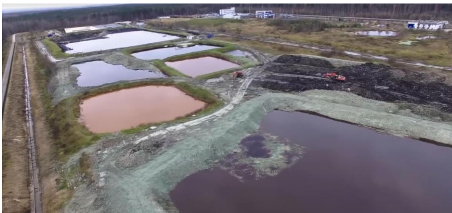
Fig. 4. Chain of intermediate cells for pumping toxic liquid into a temporary pit (in the foreground).

In 2016 the containment of cells No.68 and No.64 was undertaken. The cell capacity was increased from 25 m to 33 m through the clay embankment [25]. 34 thsd m 3 of toxic hazardous liquid of the 1st hazard class was pumped out of it into a temporary pit with a volume of 16 thsd m 3 . Obviously, only about half of the hazardous waste got into the temporary pit. Where did the other half go? It was “lost” in the intermediate cells (Fig. 4).