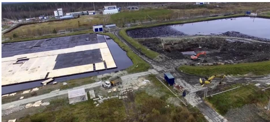
Fig. 5. Cell No.68 with inorganic waste is covered with internal floating roofs; in cell No. 64 with organics, the pit is deepened before containment.

deep aquifers with outlets on the southern part of the Gulf of Finland, through Sosnovy Bor, Lomonosov, Petergof, Strelina to Shlisselburg and further under Lake Ladoga. And this is not a self-soothing deception of the structures concerned but a scenario of an extremely dangerous situation of possible desertification of the North-West of Russia [25]. To date internal floating roofs have been installed on several cells (No.68 and No.64) and covered with a special anti-filtration coating (the Solmax 460 HDPE, 15 mm geomembrane has been deployed) so that existing waste does not mix with precipitation and does not exceed the specified pit volumes. Geosynthetic material is immune to low temperatures down to -75^{\circ}\text{C} , ultraviolet radiation, and chemicals. But such a technical solution worth \text{P}139.5 mn RUB still does not provide the leak-proofness and the complete exclusion of precipitation entering the toxic mass (Fig. 5).