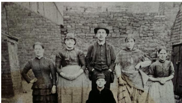
Fig. 2 Parameter History (Past), 2. Hälfte XIX. Jahrhundert

For carrying out diverse tasks in the responsibility area of federal and state authorities in the field of water management, the availability of adequately secured factual information about extreme events (high and low water) as well as hydraulic engineering systems is very important.