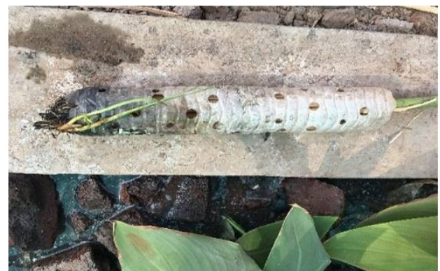
Fig. 3 Photographic view of vegetation in discarded bottle as Biorack