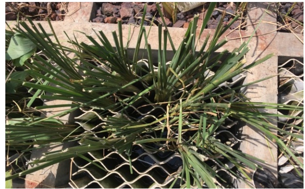
Fig. 2 (a) Photographic view of vegetation inside AC sheet Biorack

in Environmental Engineering Laboratory at WCE for analysis as per standard procedures set by APHA [3].