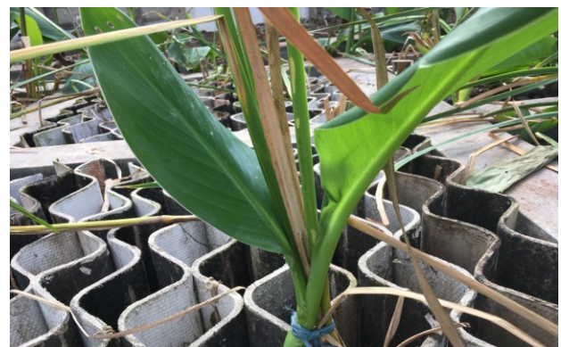
Fig. 2 (b) Photographic view of vegetation inside AC sheet Biorack