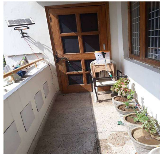
Fig.6. Complete set up of solar panel with water tank system.