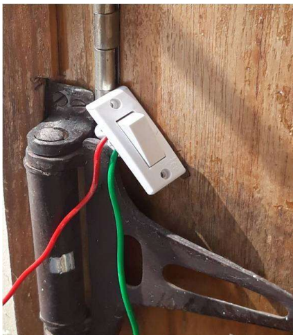
Fig.4. Electric switch which activates the motor gun.

This switch is placed between a solar tracker system and the water tank system. This switch controls the opening of a water tap. When the switch is in off condition, even though there is solar energy, there will be no water flowing through the outlet. Fig.4 shows the electric switch, which activates the motor gun.