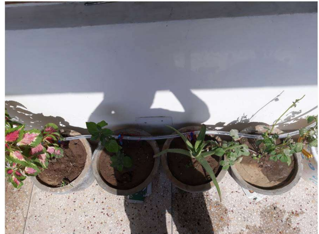
Fig.5. Four plants with pipe in the balcony.

There are four plants in the balcony. The pipe is placed near the plants as shown in fig.5. There are small holes made in the pipe by which water can drip easily.