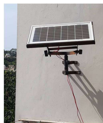
Fig.2. Solar tracker system

Solar panel voltage: 18 V, Angle set for solar tracker is: 30 Degree, Horizontal and vertical motions are possible using solar tracker system. Fig.2 shows the solar panel with the tracker system.