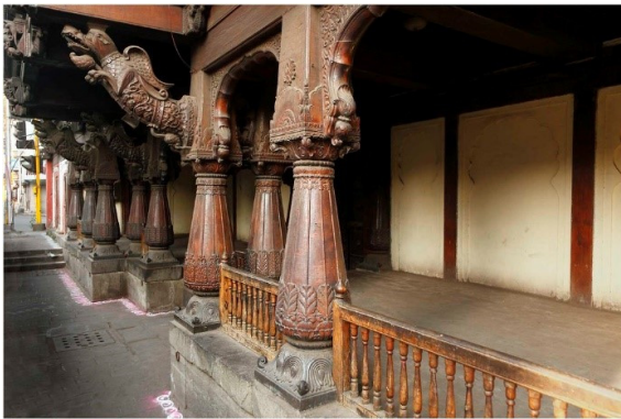
Fig. 4. Image showing ornamental wooden columns at external sofa of Vishnubaug Wada Pune