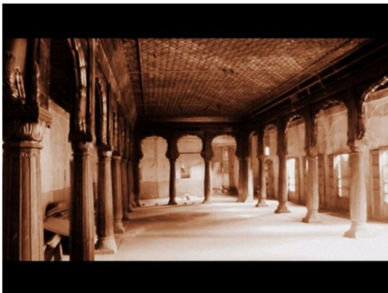
Fig. 6. Upper Floor of the wada which is mainly used for gatherings and programmes