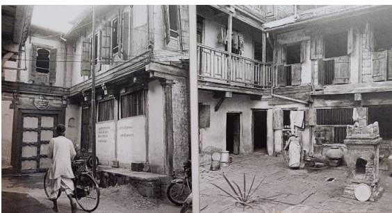
Fig.5. Image showing courtyards within the wadas