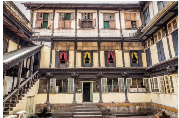
Fig. 7. Internal Court of the Vishnubaug Wada showing different elements of Wada Architecture.

Here is list of some Heritage Structures which are still standing, reflecting the culture of their time and surviving as link connecting as past to future. [11]