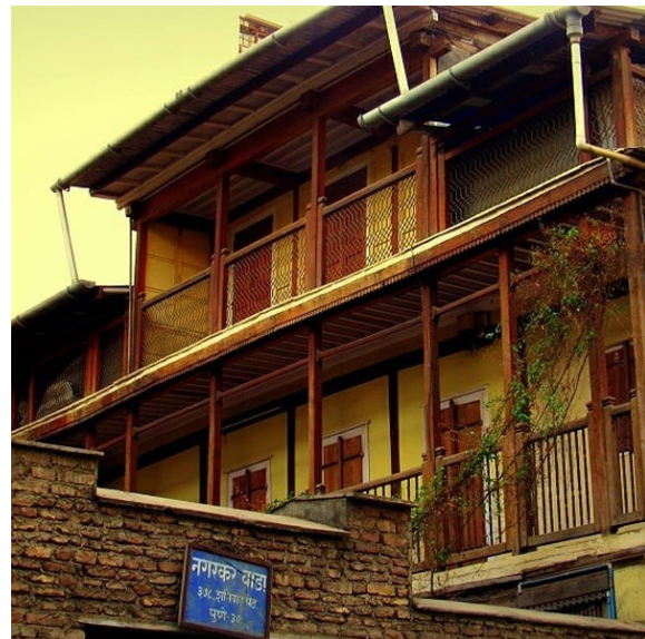
Fig. 3. Image showing wooden balconies with wooden windows & railing

Any house cannot be called a Wada without the courtyards or chowks. This is the main element in the design of wadas and its number can vary from 1 to 7 based on the size and capacity of the house. All the rooms are built facing the courtyard. This private open space is commonly used by the families residing there and can be converted to public space during festivals. This space is used to perform rituals, prayers, for gathering, gossip sessions and more.