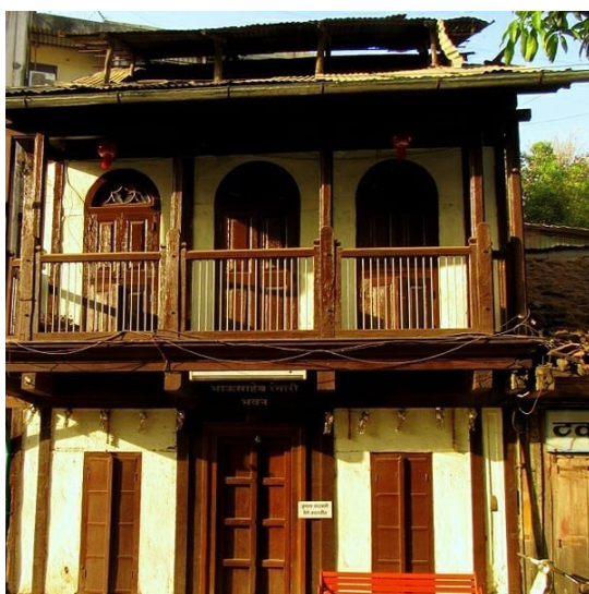
Fig. 2. Image showing wooden windows, doors and Typical railing pattern in wadas

Wooden Balconies with wooden doors and windows. Windows are wooden windows generally starting from the floor. Wooden Railings with wooden vertical posts are common feature of wada architecture.