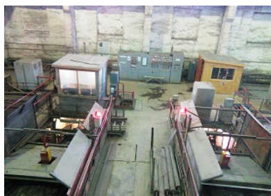
Fig. 2. OCS RLP-21T on conveyors No. 1T and No. 2T ZhDM-2.

After completion of the full cycle of bench and industrial tests of the OCS-RLP-21T on conveyors, in October 2016 it was launched on conveyor No. 1T ZhDM-2 (Fig. 2, left), and in January 2017 similar units were installed on conveyors No. 2T ZPP-2 (Fig. 3, right), and No. 1A ZPP-1 (Fig. 4, right) [6-7].