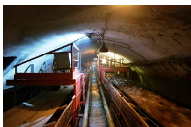
Fig. 3. OCS RLP-21T on conveyors No. 1A (right) ZhDM-1.

The optimal measurement procedure was selected. Single measurements (1 sec) are performed one after another without gaps. grades of copper, zinc, lead and iron were calculated as averages of 20 single measurements; grades of silver, cadmium and molybdenum were the averages of every 40 single measurements.