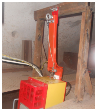
Fig. 7. OCS RLP-3-02 on conveyor No. 1 at ZPP-1.

4. In August 2019, the most recent modification of OCS-RLP-21T (the same as at BPP, KPP and NIR) was installed on conveyor No. 1 ZPP-1 (Fig. 2, left) to replace the OCS RLP-3-02 (Fig. 7). For ease of maintenance, this OCS folds the floor at an angle of 90° [9].