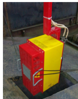
Fig. 1. OCS RLP-21T.

The import substitution program dictated that EDXRF OCS RLP-21T (Aspap Geo LLC, Almaty, Kazakhstan) should be chosen as the base unit for the study. OCS RLP-21T was designed specifically to determine low (2+ ppm) silver grades (Fig. 1). The most advanced X-ray tubes, silicon drift detectors, the latest high-speed electronics and powerful software are used in the OCS, which ensured confident determination of silver and cadmium grades of 2+ ppm. This conclusion was made according to the results of bench tests on control powder and finely ground samples at ZPP-1 and ZPP-2.