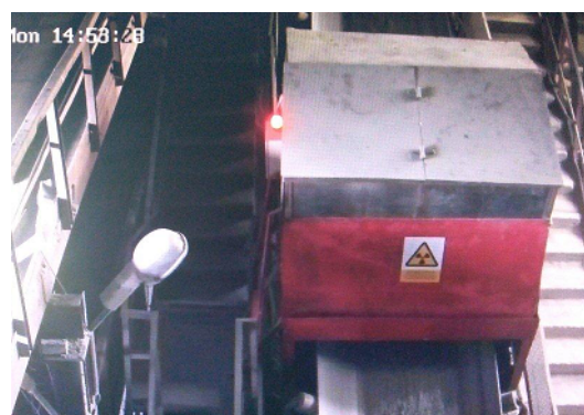
Fig. 5. OCS RLP-21T on conveyor No. 4 KPP.

The following silver contents were recorded in one five-minute measurement: 19.6 ppm (maximum) and 6.5 ppm (minimum). This is another confirmation of efficiency shown by unique methodological and mathematical fragments of the OCS RLP-21T.