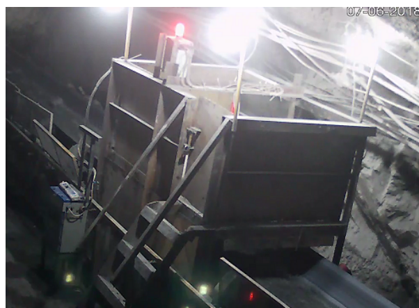
Fig. 6. OCS RLP-21T on the main conveyor of the NPR.

3. OCS RLP-21T unit on the main conveyor belt of the Nurkazgan underground mine was put into operation on June 14, 2018 (Fig. 6). Target elements are copper, lead, zinc, silver, cadmium, and iron.