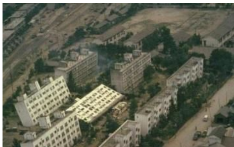
Fig.3. The liquefaction due to the Niigata earthquake in 1964 with 6.4 RS magnitude [7].

The disasters of liquefaction could result in the tension of the pore water itself. When liquefaction occurs, then the strength of the soil and the ability of the soil deposit to withstand the load decreased. The effective stress of the soil due to the cyclic load received by the soil with grainy characteristics, water saturation, and medium density, resulting in the soil experiences a change in nature from solid to liquid, as consequence occurs damage to residential buildings such as collapse.