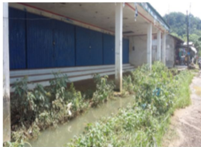
Fig.8. The condition of supermarket due to land subsidence

The description of the buildings in the Jondul Rawang Housing is the group of buildings that have several supermarkets or minimarkets owned by people. Fig. 8 shows the supermarket due to the changes of land subsidence in the study area. It shows the abandoned supermarket with a puddle of water due to the lack of water shrinkage in the location. The plants that grow in this location are needle grass, indicating that soil type is grainy.