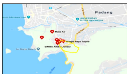
Fig.6. The Map of Study Area [13].

The study area is in the Jondul Rawang Housing in Padang City. This area laid on the coast of Padang precisely in the District of South Sumatra, West Sumatra. This area was once a ricefield the area which was used as a residential area. This area has very low water absorption capacity.