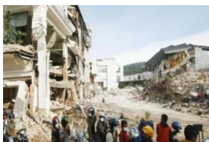
Fig. 1. Buildings collapse due to the Mentawai Earthquake in 2009 [3].

Indonesia is an archipelago country laid between three huge plates, which are the Eurasian Plate, the Indo-Australian Plate and the Pacific Plate [1]. The meeting point of the three plates is the source of great tectonic earthquakes that frequently hit Indonesian territory. Padang city located in West Sumatra is one region where to be crossed by the three plates. The earthquake in September 2009 that struck most of the coastal areas in West Sumatra killed more than 1,000 people and 10,000 buildings collapsed [2].