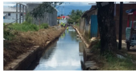
Fig.10. The refinement of the drainage canal

As for substandard drainage system issues, it is necessary to have a good process of improvement and drainage planning. As the authors visited the study area found that there was a process of renovation on the drainage system. These repairs aimed to control water capacity during heavy rainfall and can prevent flooding in the future (Fig. 10).