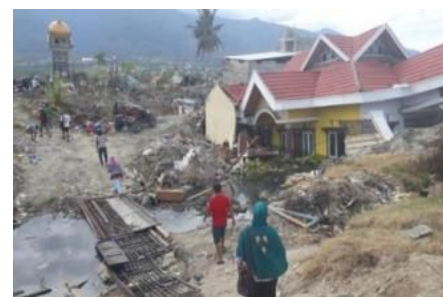
Fig.2. Sinking house in Bolora Housing due to earthquake resulting liquefaction 2018 [6].

An earthquake is a natural phenomenon due to sudden breakdown of rock mass in the ground causing disturbance to the soil stability due to earthquake energy that propagates to the surface so that the soil is no longer able to support the buildings above. The event of decreasing soil mass is called liquefaction [1]. Liquidation is a condition where the soil mass loses its bearing capacity [5].