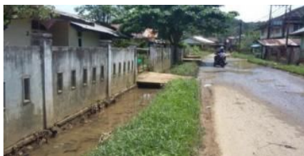
Fig.9. The degradation of the drainage canal

Besides soil degradation caused by the soil bearing capacity, the other causes are also caused by substandard drainage conditions in the housing (Fig. 9). In the picture, this below can be shown that the drainage system in the housing, which it's quite unworthy and the elevation of the drainage slope. It is caused by the process of land subsidence yearly. If the intensity of the rainfall is very high, it will enable the area to be very susceptible to flood disasters.