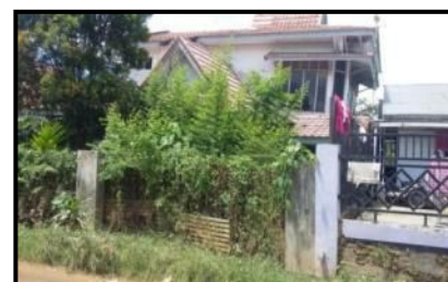
Fig.7. The degradation of soil bearing capacity

Following observation in the field, the type of soil at that location is peat soil. Peat soil is formed from the accumulation of residues from plants that are half-rotted or undergoing incomplete decomposition [15]. The type of soil in the observation location also has a lot of water content, as indicated in the Jondul Rawang Housing is a swampland that heaped up by the developer for the construction of housing (based on the interviews with the residents). The location under these conditions is very susceptible to the risk of liquefaction during an earthquake in Padang city.