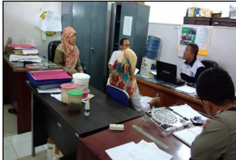
Fig. 7. Discussion with representatives from ministry of agriculture at the district level

All related stakeholders have a desire to participate in this research program because peatland restoration is very important for the sustainability of natural resources in the research area, Ogan Komering Ilir, South Sumatra. Discussion with the representatives from ministry of agriculture at the district level was carried out to gather information about any programs that this institution applied (Fig. 7). Furthermore, some information and support from private company which operate in the research area was also needed, hence the discussion with this actor was also done (Fig. 8). Household interview (Fig. 9) and questionnaire method (Fig. 10) were important to gain data and information about household activity, support, and hopes in the future regarding peatland condition in their area. Finally farmers group meeting (Fig. 11) and focus group discussion (Fig. 12) was also conducted in order to gather information and support from group of people. It is very important to make sure that community activities in peatland area did not endanger the preservation of natural resources in this location.