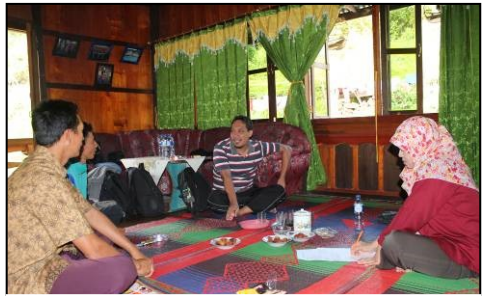
Fig. 6. Focus Group Discussion