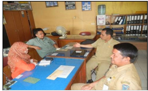
Fig. 2. Discussion with representatives from ministry of forestry at the district level