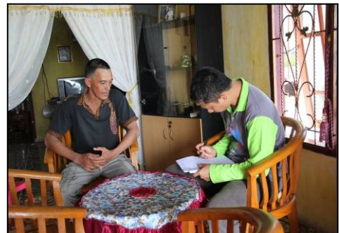
Fig. 10. Questionnaire method