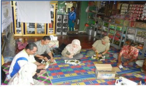
Fig. 11. Farmers group meeting