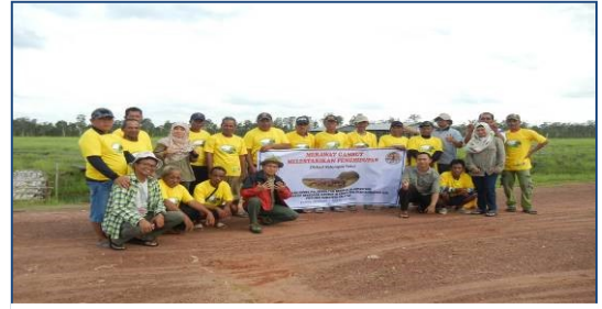
Fig. 12. Focus Group Discussion in the village level