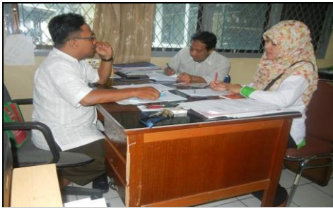
Fig. 1. Discussion with representatives from ministry of industry at the district level

Stakeholder engagement strategy in this natural resource management research project was by conducting face to face discussion with at least one representatives of each stakeholder group of organization that related to the research projects. These stakeholders are officers from the ministry of industry in district level (Fig. 1), forest and environmental officers at provincial and district level (Fig. 2), private company, head of the village, the leaders of community group), household interview (Fig. 3) and questionnaire method (Fig.4), village meeting (Fig. 5), Focus Group Discussion (Fig. 6), Inviting and encouraging group leaders to influence their members to get involved in the projects. These face to face interactions and constructive discussions generate beneficial collaborative participatory mechanism in managing natural resource [11].