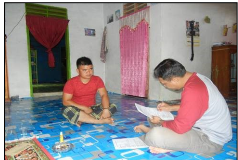
Fig. 4. Questionnaire method