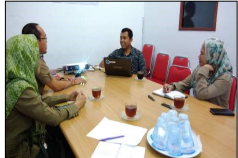
Fig. 8. Discussion with representatives from private company