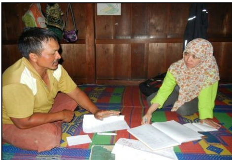
Fig. 3. Interview to household and the community leader