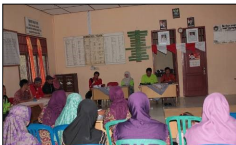
Fig. 5. Village meeting