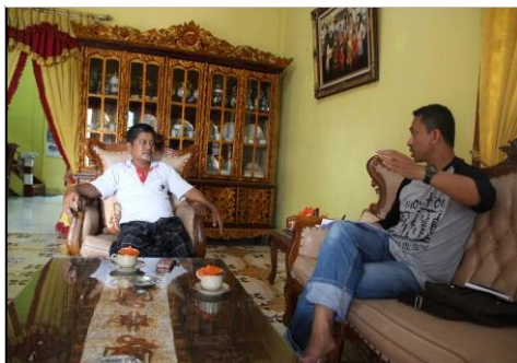
Fig. 9. Household interview