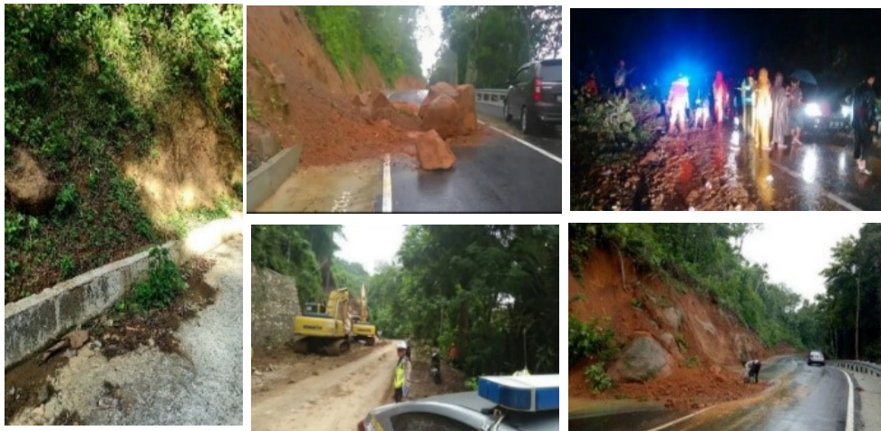
Fig. 3. Landslide inventory data

This research resulted from the statistical method used the accuracy of the method (P) is 98%. The results of validation using the R-Index in the verification class are very high resulting in an accuracy of 55%. The results of the landslide conversation map that were made also compared the landslide events in the real location and showed quite accurate results.