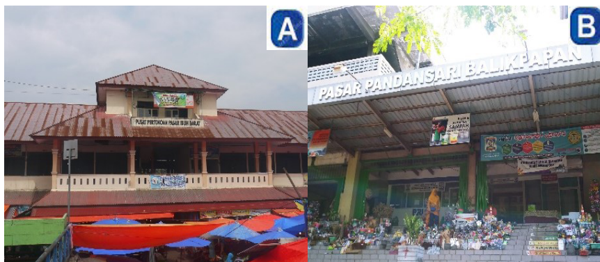
Fig. 1. (A) Ibuh Market, Payakumbuh City and (B) Pandansari Market, Balikpapan City

To obtain the evaluation of environmental planning and management implementation in these two traditional markets, researchers conducted interviews with market managers. Some questions that were asked to market managers included: (1) the master plan of market management that was environmentally friendly, (2) supervised the case of environmental pollution and (3) decisive action on the perpetrators of environmental pollution or not in accordance with applicable regulations in traditional markets.