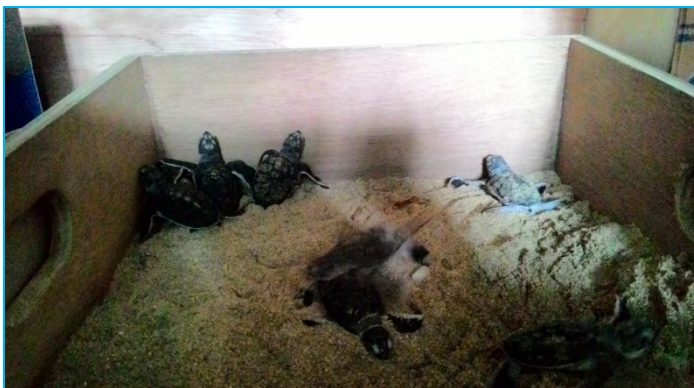
Fig. 3. The results of hatching turtle eggs in the automatic turtle eggs incubator

The development of turtle egg incubator technology has so far come to the development of automatic technology that is equipped with temperature, humidity sensors. In addition, to monitor the results of hatching has been connected to the LCD screen and the control system can be controlled by using Bluetooth. Sand media are still maintained as the best