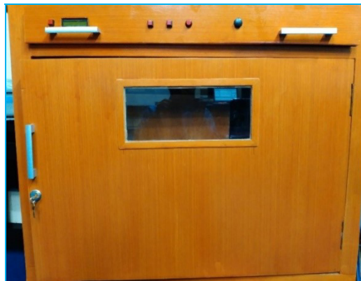
Fig. 2. The results of the automatic turtle eggs incubator production

The results of the experiment showed that from 75 eggs during the 46-day incubation period, 27 eggs were incubated from 30 eggs that were hatched or about 90% of the eggs could hatch.