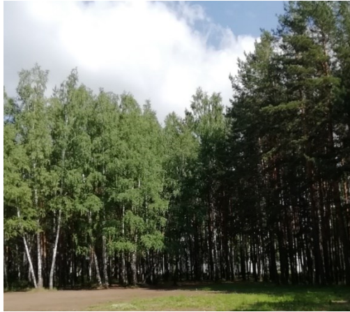
Fig. 1. A fragment of the stand of pine and birch plantations.

Planting is represented by small areas of pine and birch forests. Pine forest stand (small grass pine stand) with an area of about 1.0 ha of class II bonitet has the following taxation characteristics: diameter at a height of 1.3 m 26.0 cm, height 23.5 m, fullness 0.9; stem wood stock - 290 m 3 . Birch forest stand (motley grass birch stand) with an area of 0.4 hectares of class III bonitet has the following taxation characteristics: diameter at a height of 1.3 m 25.0 cm, height 20.5 m, fullness 0.7, stem wood stock 170 m 3 .