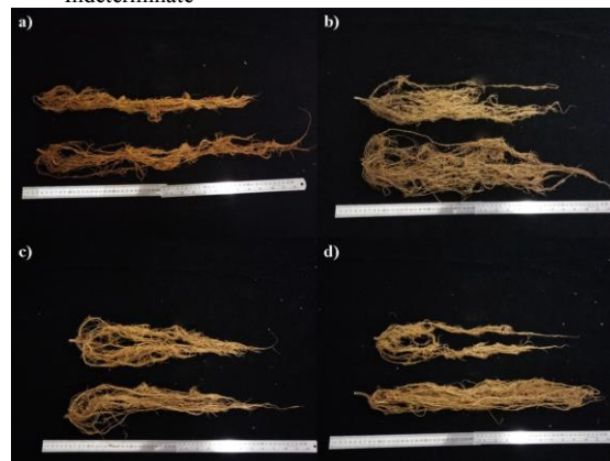
Note : a) Non-saline stress ( 0.42 \text{ dS}\cdot\text{m}^{-1} ); b) Low saline stress ( 2.93 \text{ dS}\cdot\text{m}^{-1} ); c) Low saline stress ( 4.74 \text{ dS}\cdot\text{m}^{-1} ); d) Moderate saline stress ( 6.03 \text{ dS}\cdot\text{m}^{-1} ), Left = Determinate; Right = Indeterminate.

sign of standard error. DET = Determinate ; IND = Indeterminate