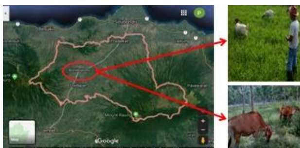
Figure 1. The study area in Bondowoso East Java Province, Indonesia

The study was conducted at field farming with large area ± 1.2 ha, consists of 6 cows, and 10 goats in Bondowoso East Java Province, Indonesia. The topography of the Bondowoso from an altitude 113°48'10" - 113°48'26" BT dan 7°50'10" - 7°56'41" LS.