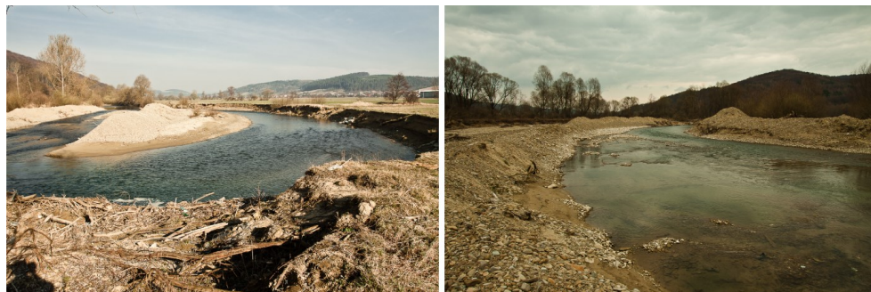
Fig. 3. River gravel bed degradation after illegal gravel activity on Slovakiens rivers.

We could conclude that gravel mining has significant influence on morphological processes during last study period (after 1987) when the formation of sinuous single-thread river pattern was registered. We can identify a several evolution phases for both rivers. The first one is channel degradation as a reaction of the climatic changes on the end of the Little Ice Age. The second one is riparian forest development (stabilization phase) between 1981 and 1987 supported by low flood activity. Extreme flood events after 2002 as well as gravel mining led to intensive erosion processes (1,9 m bedrock incision on the Ondava River) and new floodplain vertical benches creation. This vertical differentiation on the Topľa River is not so significant. Rinaldi et al. [2] conclude that braided rivers with higher sediment supply are more sensitive to gravel mining than sinuous and meandering river with lower sediment supply.