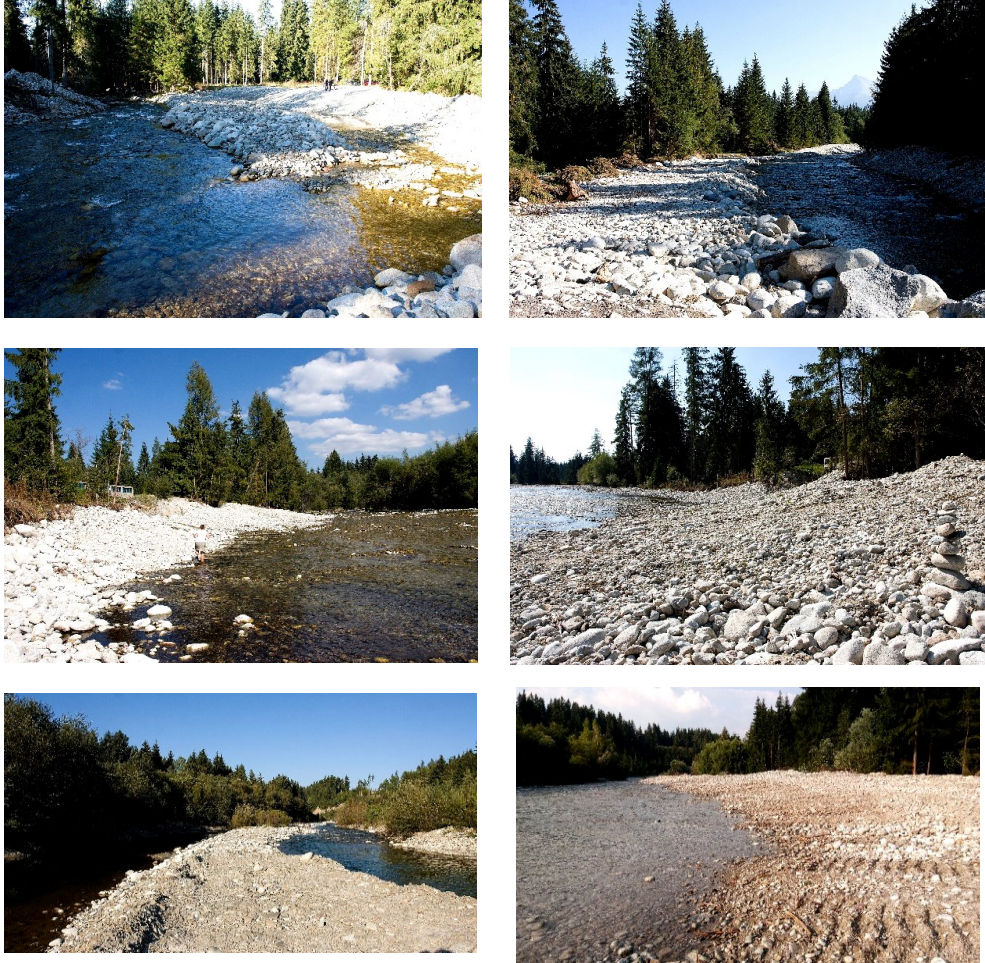
Fig. 2. River gravel bed degradation after illegal gravel activity on Slovakiens rivers.

flow channel and isolated floodplain from the active channels due to 2 m high new artificial banks. This type of river regulation including gravel extraction and gravel replacement were also occurred on the river reaches where the residential area is missing and there was no threat to property rights and lives.