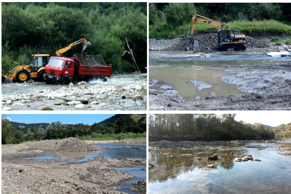
Fig. 1. Illegal gravel mining in Polish Carpathians: excavators and lorries in work and river gravel bed degradation after illegal gravel activity

From the author's calculations, it appears that the transport of bed load in Czatożanka and Jałowiecki streams region was about 14 000 tonnes after the year 1950. This means that from the channels of the discussed streams, much more gravel was removed than reached the Małe Widły region. What does this mean for the stream channel? As mentioned above, streams tend to reach some kind of equilibrium and such an equilibrium is generated after the bed load is taken out of the stream (Fig. 1). When a stream doesn't receive enough bed load from Babia Góra, it starts to erode its own bed and banks. Next, it starts to cut into the bed deeper and deeper, often through gravel formations and rock stratum. This means that the stream is deprived of its protective cover – the previously mentioned armouring – it is like a skinned living organism. The consequence of such a condition is the Jałowiecki and Czatożanka streams cutting into their beds to a depth of approximately 80 cm in some places, even over 1 m over the period of the last 50 years (on the basis of the author's estimated calculations, observations and field interviews).