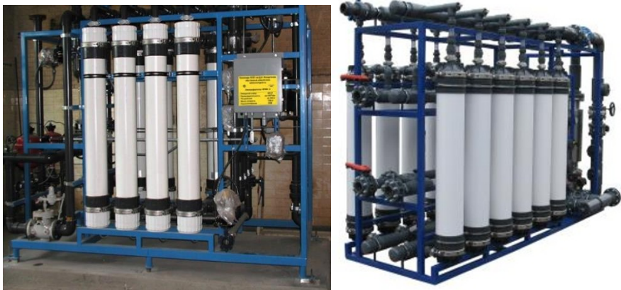
Fig. 1. Ultrafiltration membrane modules

Ultrafiltration is a method that uses a membrane to separate by size ions of heavy metals, petroleum products, macromolecules and suspended solids. Ultrafiltration is the boundary between microfiltration and nanofiltration, combining technological solutions of boundary processes. Ultrafiltration membranes have a wide range of applications in various industries. They are successfully applied in the processes of sewage treatment of machinery building, metallurgy and petroleum industries [2,3].