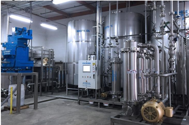
Fig. 3. Ultrafiltration facility for treatment of galvanic sewage

Application of ceramic membranes in Russia is not wide-spread now. They were considered to be of limited application. At the same time, in many other countries (in Europe and Asia, for instance) ceramic membranes have been actively used both for wastewater treatment and galvanic production. In Europe, ultrafiltration is used in more than 80 plants with galvanic shops.