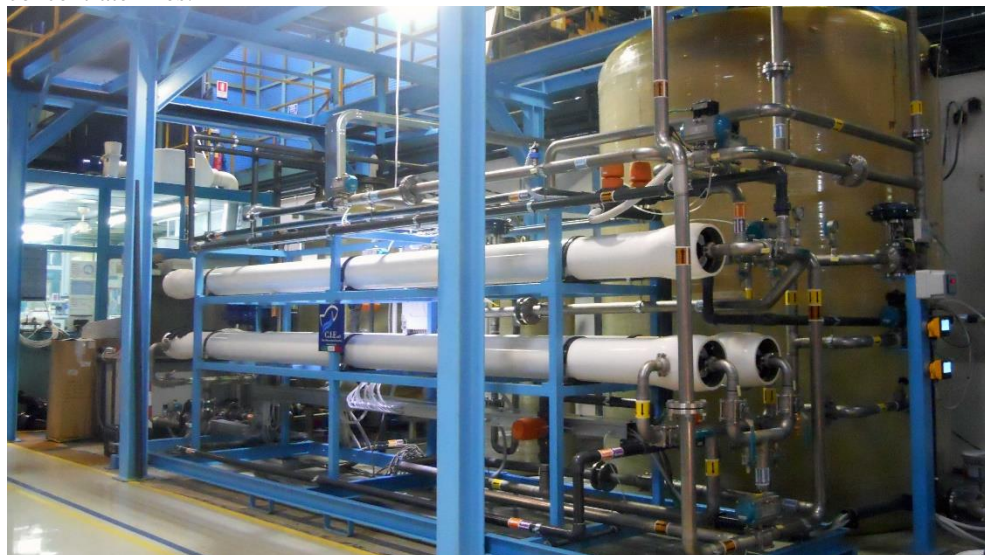
Fig. 5. Reverse osmosis module for industrial wastewater treatment

The main working element is a semipermeable membrane. Cellulose acetate or polyamide materials are most often used as membrane material. To ensure operation, it consists in a housing providing connection of the input water supply line, permeate and concentrate lines.