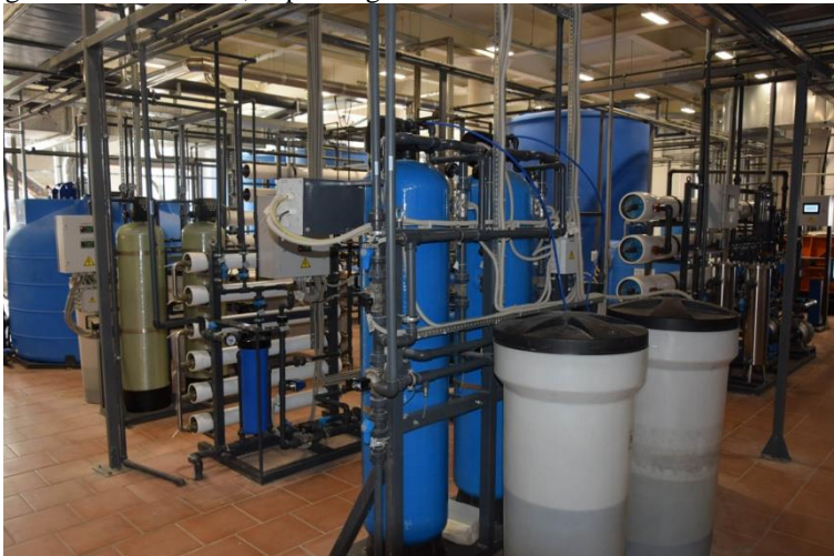
Fig.4. Nanofiltration facility for treatment of galvanic sewage

Nanofiltration is a process of membrane filtration of wastewater, which ensures the removal of multi-charged ions from water, depending on the size.