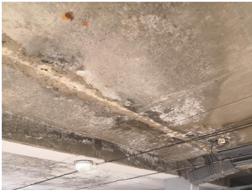
Fig. 5. Parking No.1, 3rd floor. Efflorescence on the slabs surface at the expansion joints