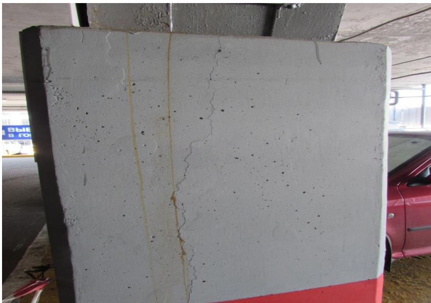
Fig. 3. Parking No.1, 1 st floor. Vertical column crack.

- Cracks in columns, due to corrosion of the reinforcement (Fig.3, 4);