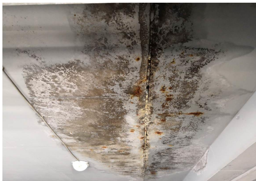
Fig. 6. Parking No.2, 2 nd floor. Cracks in the slab with traces of efflorescence and corrosion of reinforcement