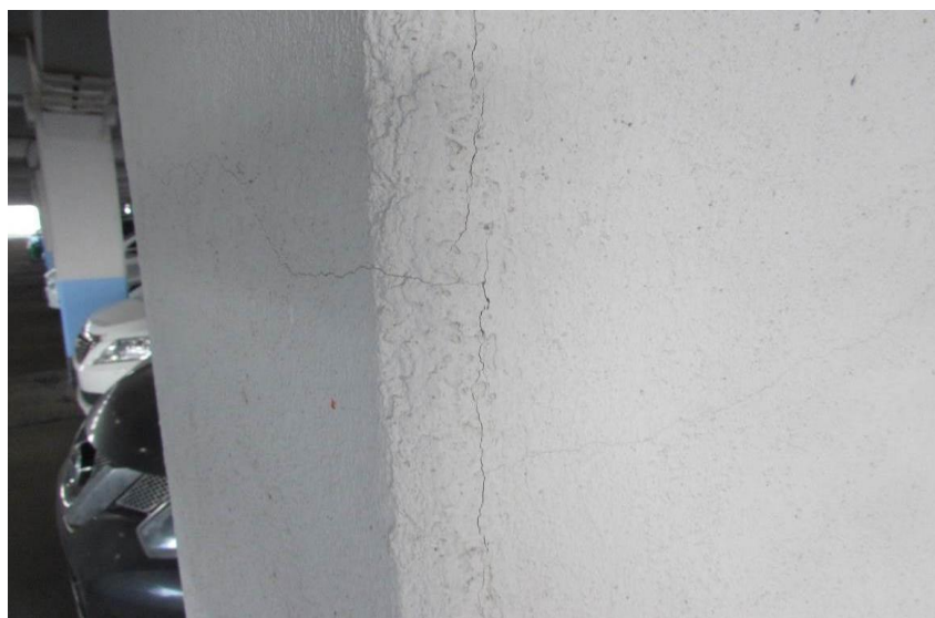
Fig. 4. Parking No.2, 1 st floor. Vertical column crack.