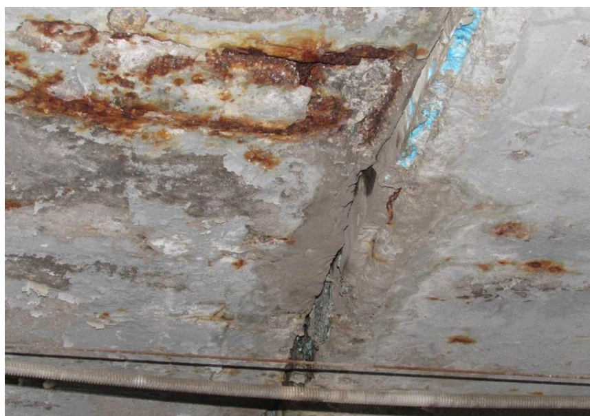
Fig. 8. Parking No.2. Deflections of floor slab sections between expansion joints. 1st floor

As mentioned above, Parking No.2 has undergone significant deformations from the construction of the railway tunnel and the new terminal complex. To date, according to geodetic monitoring, subsidence of Parking No.1 and No.2 buildings is within the limits of measurement accuracy and do not cause concern.