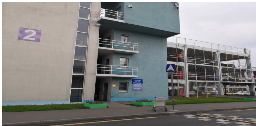
Fig. 2. Fragment of the parking No.2 facade

Open parking No.1 and No.2 are three-tiered buildings, built in 2004, designed by ZAO “Masterskaya arkhitekтора V.M. Ginzburga” with design changes by ZAO “Proektstroynauka”. Their dimensions are 80,4x40,8m and height H=13,5 m. Building criticality level – regular. Structural diagram of a building – skeletonized. Foundation under columns is pedestal footing made from monolithic reinforced concrete. Laying depth of the foundation is 2.9m, footing dimensions are 2.4x2.4m by outer axles and 2.4x3.0m by middle axles.