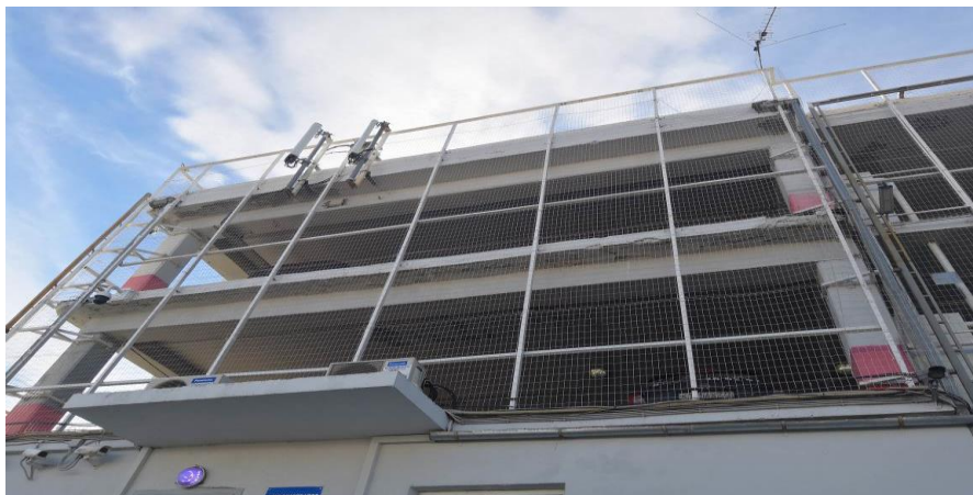
Fig. 1. Fragment of the parking No.1 facade

Particular to renovation of Vnukovo-1 airport, that started in 2005 is the fact that during construction it was necessary to ensure operation of a number of maintained buildings. Among them are open parking spaces No.1 and No.2. (Fig.1,2)