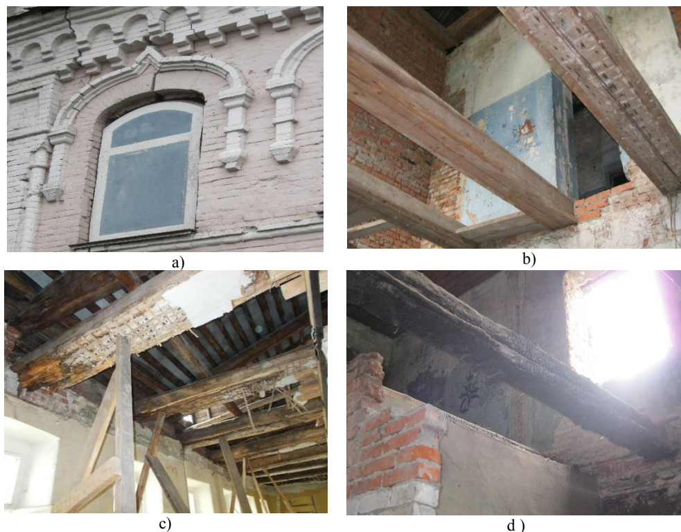
Fig. 1. Specific damages of beam structures of historic buildings:

long-term operated constructions. In this case, the maximum load on the structure is estimated experimentally. Apart from steel prostheses, reinforced concrete ones [8] also become common, which are fastened to wooden elements of gluing deformed reinforcement. Such prostheses are used to strengthen the timber frame joints. In some works, for example [9], the restoration of structures is recommended only with the use of external prosthesis, with preventive repair being preferred.