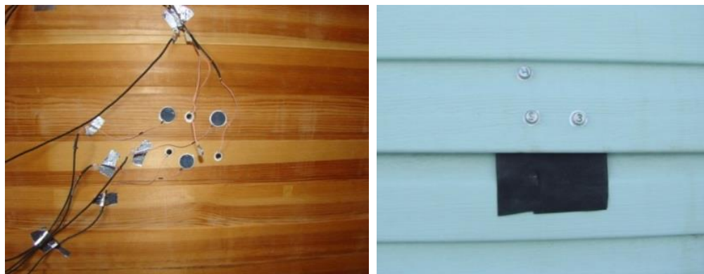
Fig. 2. Installation of temperature and heat flux sensors

To assess the heat-shielding qualities of the outer wall of a wooden frame with insulation by foam polyethylene on the selected wall section, experimental determination of heat transfer resistance was carried out in accordance with GOST 26254-84 “Buildings and Structures. Methods for determining the resistance to heat transfer enclosing structures” and GOST 25380-2014 “Buildings and facilities. Method of measuring the density of heat flux passing through the enclosing structures”. The sensors were installed both on the inner and on the outer surface of the wall (Fig. 2).