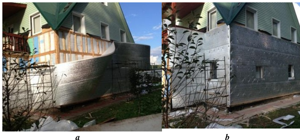
Fig. 1. The formation of the insulating shell of a frame building with the help of rolled polyethylene foam: a - deployment of a roll of IPE; b - for fixing the insulation and stitching the roll of IPE; c - formation of an isolation contour and window openings

In low-rise frame construction, the use of rolled polyethylene foam (Fig. 1), which allows to obtain a seamless insulating casing, approaches the trend [15–17].