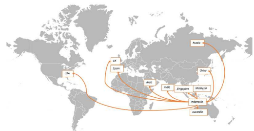
Fig. 2. Flow of wooden batik product distribution in international scale.

Based on the results of value chain analysis of wooden craft products and the description of sales distribution of wooden batik products allows the value of products and high value-added products. Value chain formed by wooden batik products shows the possibility of the possibility of value-added products from craftsmen to collectors, traders, until reaching the final consumer. Value-added products could also occur due to differences in the location of product sales that can reach out of Kreet Tourism Village, especially products that reach the international sales scale when raw materials and product manufacturing process is only done in local to regional scale.