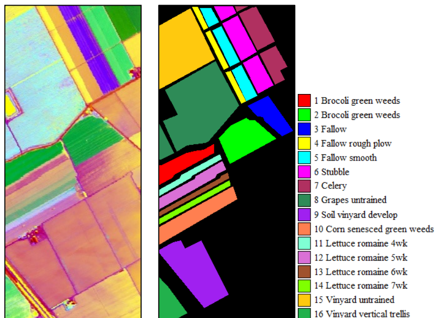
Fig. 1. Salinas image in false colors (first 3 principal components) and ground truth image for 16 classes.

A Salinas hyperspectral image (the Salinas Valley, California) measuring 512 \times 217 pixels obtained from the AVIRIS sensor on October 8, 1998 was used in the experiment [12]. The features constructed by the principal component analysis were used for processing. Fig. 1 shows the image in false colors (the first three principal components) and the ground truth image for 16 classes.