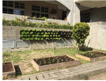
Figure 6. Four-plows elementary school demonstration