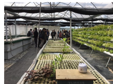
Figure 3. vertical agriculture

Most public sector building roof has green facilities. However, the popularization rate of urban agriculture in Taiwan is still not significantly improved. The main reason is that the public cannot apply the concept of economic added value on green facilities of urban agriculture lead to ineffective result for private sectors in