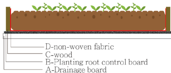
Figure 4. Common mold materials

Taiwan. Recently, the reduction of green facilities costs created opportunities for private sectors to participate the act due to setting materials innovation. The setting of green facilities materials of urban agriculture are composed of drainage board, planting root control board, wood, and non-woven fabric shown in Figure 4.