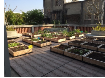
Figure 7. Quiaoxiao elementary school demonstration