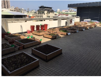
Figure 5. Huilai elementary school demonstration