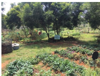
Figure 1. flat agriculture

multiple functions. Building plants on the roof also provides many ecological and economic benefits. [4] Green roofs have a layer of living plants on top of the structure and the waterproofing elements. Green roofs can be installed on a wide range of buildings, from industrial facilities to private residences. Figure 1 to 3 presented the typical types of urban agriculture in Taiwan.