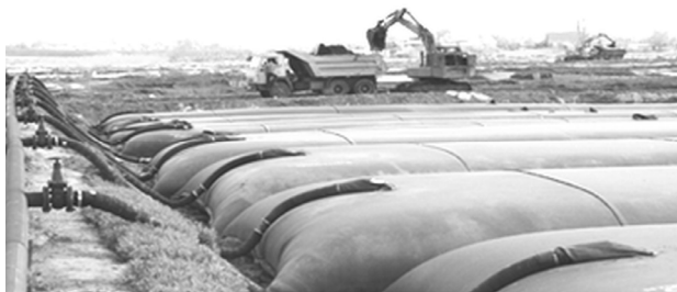
Fig. 6. Geotubes in working condition

The second problem is the sludge pit construction. The conventional technology of the sapropel extraction requires grassy turf to be removed completely on the pit territory. Dike foundations are buried 0.2 m lower than a pit bottom. Dikes are filled with obligatory compaction by bulldozers or excavators. There is no possibility to fill protruding dikes around Lake Khotogor due to the permafrost layer under 0.5 m depth and the upper peat layer of 0.5 m thickness. Therefore, pit walls have to be made of some structural materials, the most available one being larch. In Verkhoyansky district of Yakutia frosts of 40...50 °C settles in November and lasts till May. In some years they can reach more than 60 °C which results in the complete freezing of peat in pits. If special measures are not taken, it is unlikely to thaw during the following summer. Under these circumstances the method of settling peat in pits can be considered impossible, with the method of rotary drum filters BFA of the Astrakhan sapropel center being an acceptable alternative. But this pattern requires powerful energy generating units to drive electric motors. The better method is to use geotubes sewn from woven fabric of geotextile (Fig.6).