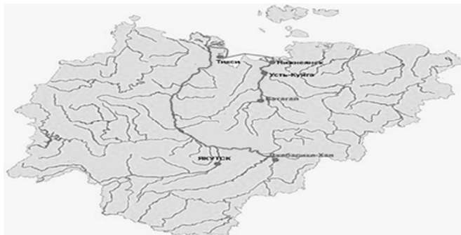
Fig. 1. The route of coal delivery to Batagai settlement.

The task was to evaluate peat deposits of Verkhoyansky district for their production economic feasibility and the possibility of peat use in boilerhouses to supply Batagai district centre with heat.