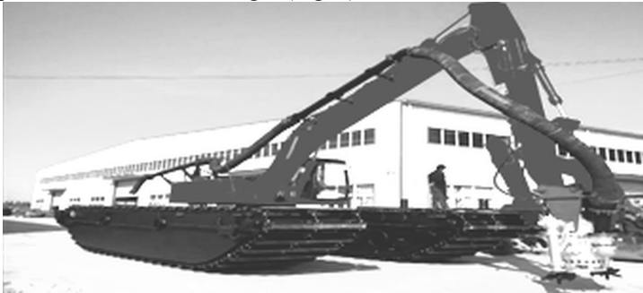
Fig.5. Swampking pontoon excavator with a dredge pump.

be delivered by a road only. Therefore, a pontoon single-bucket excavator with a dredge pump is proposed to be used as a dredger (Fig. 5).