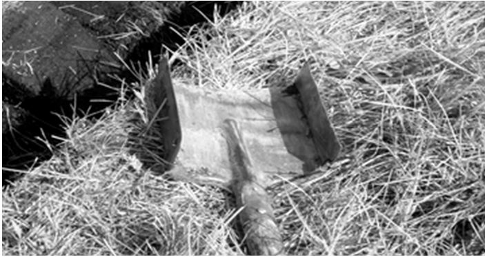
Fig. 2. Spade for cutting peat bricks .

However, rainless spells are quite rare and milled peat, even dried, has high moisture absorption. Therefore, in case of precipitation dried peat must be covered. Peat bricks should be laid in a wave-like way for preliminary drying (Fig. 3).