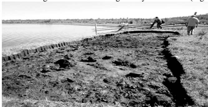
Fig.4. Site of peat milling at Lake Tokolohn.

Milling Batagai's shallow deposit peat is considered to be infeasible since it can be extracted only once and large areas are left damaged for years to come (Fig. 4).