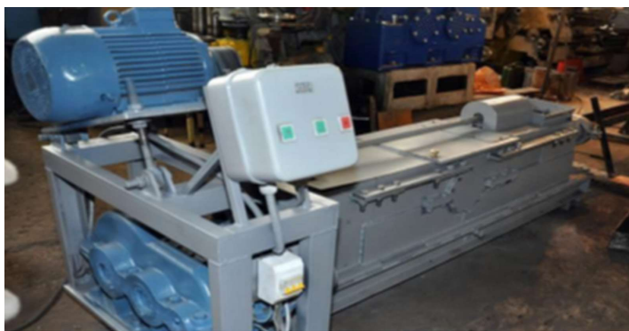
Fig. 1. Press BT.ShP 50.0.

Briquetting of the mixture consisting of filter cake from Kom somolets and Kirov coal-preparation plants was carried out on a small industrial auger and piston installation with the press BT.ShP 50.0 (figure 1) after mechanical activation on the industrial mechanoactivator.