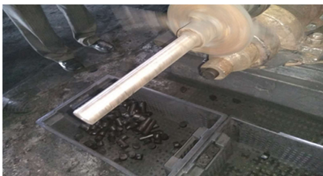
Fig. 2. Samples of briquettes.

The conducted investigations of briquetting of the mixture consisting of filter cake from the coal-preparation plants, previously dried at the atmospheric air to optimum humidity, on the high pressure auger and piston press, showed a possibility of preparation of briquettes of required quality. All pressed briquettes saved the form (Figure 2).