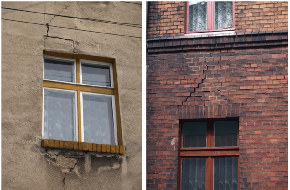
Fig. 3. Cracks in load-bearing walls due to loosening of a ground caused by mining mining floor dislocations [4]

cases presented, there was a loss of load-bearing capacity of the construction elements, combined with a threat to the safety of building. These damages were revealed in the buildings due to the movement of the mining operations front beneath them.