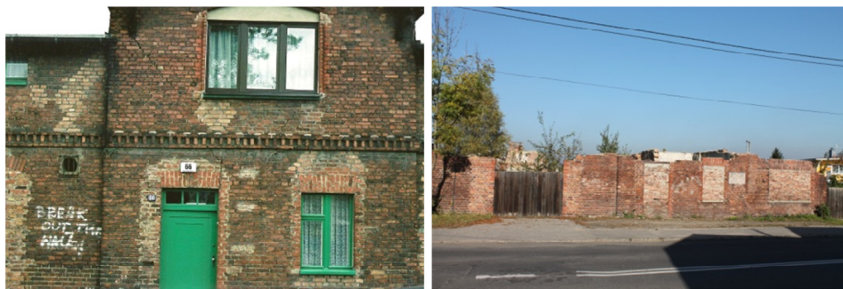
Fig. 4. Damage of a building on the convex periphery of the mining trough, while the impact of terrain threshold a) cracking of the front wall - condition for 2002, c) condition of the building in 2014

Fig. 4a shows an example of a building that was in the range of the impact of the outcrops of the active fault of the geological layers. Activation of the fault zone was triggered by mining exploitations, which in several subsequent seams undermined the dislocation plane. As a result of repeated exploitation of the deposit in the vicinity of an active geological fault, in the building the damage occurring during subsequent years led to the necessity of excluding it from use and for demolition, despite taking protections and repairs (Fig. 4b)