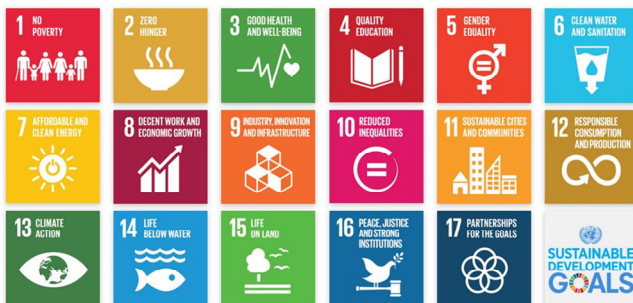
Fig. 1. Sustainable Development Goals - SDGs ( http://www.un.org/sustainabledevelopment/sustainable-development-goals/ )

The 2030 Agenda lists 17 main Sustainable Development Goals (SDGs) with allocated operational targets specifying ways of achieving them (fig. 1). They make up a list