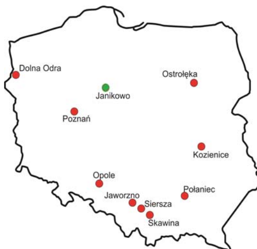
Fig. 1. Location of power plants (red) and thermal power stations (green) from which the analyzed ash samples were collected

The geochemical and petrographic analysis of fly ash from Polish power plants and heat plants (14 samples) collected from ash storage sites at bituminous coal-fired power plants was carried out. The samples were collected at the following power plants: Skawina, Siersza, Połaniec, Kozienice, Jaworzno (2 samples), Ostrołęka, Poznań, Opole (3 samples), Dolna Odra (2 samples), and the Janikowo thermal power station (Fig. 1).