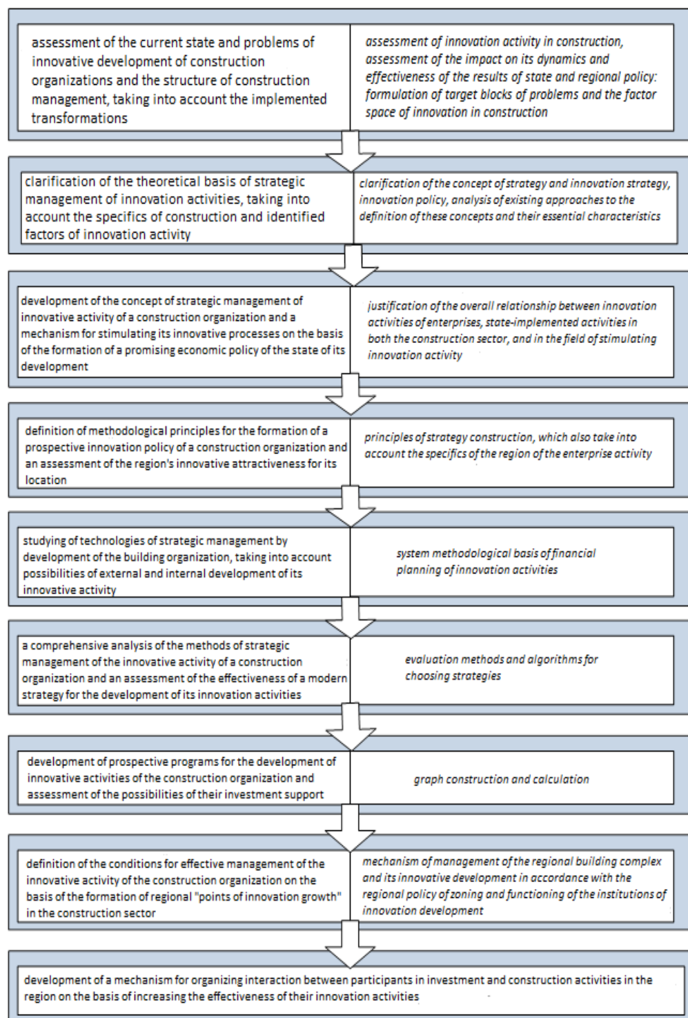
Fig. 1. Principal scheme for the development of a methodology for the formation of a promising innovation policy in construction on the basis of the introduction of modern methods of strategic management of innovation activities