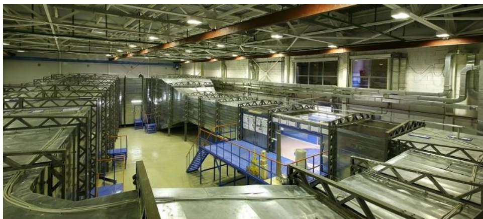
Fig. 2. Large Gradient Wind Tunnel NRU MGSU