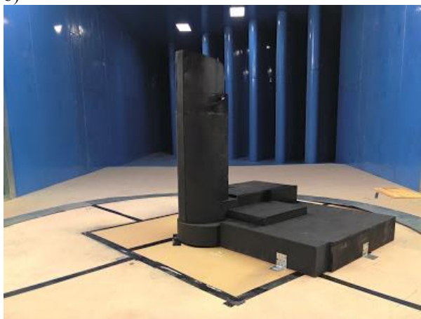
Fig. 3. a) Multifunctional business center, b) Model of a multifunctional business center

Design and production of the model on a reduced scale for experimental studies is performed. The scale of the layout is chosen from the compliance conditions established for the given tunnel of restrictions on the degree of cluttering of the cross section of the working part (in this case, M 1: 100) (Figure 3, b)) (GOST R 56728-2015) Buildings and