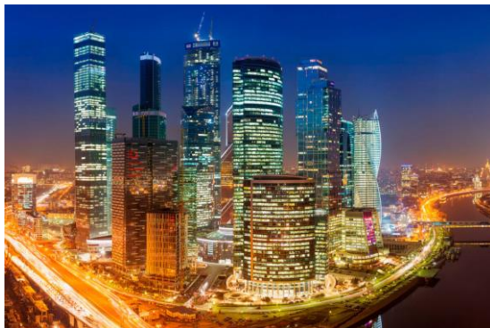
Fig. 1. High-rise buildings in Moscow (Moscow-city)

aerodynamic parameters should be included in the design documentation, including the average and pulsation components of the estimated wind load, maximum values of wind load, resonance vortex excitation, etc. However, the determination of these values is possible only based on testing the layout in high-rise objects in wind tunnels of architectural and construction type [3,4,10].