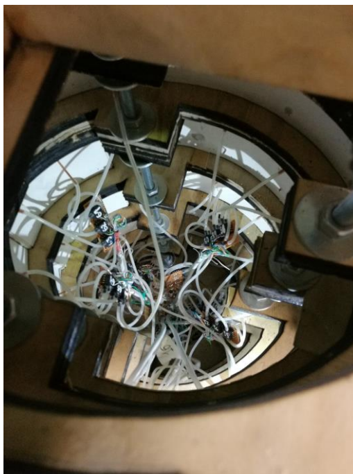
Fig. 4. Drainage system installation

The model of the investigated building was installed on a specialized turntable in the working area of the wind tunnel. After that, the installation was started and the air flow was fed to the model. The characteristic velocity of the air flow in the pipe is chosen to be sufficient to ensure self-similarity in the Reynolds number, when a further increase in speed does not lead to a significant change in the averaged values of the aerodynamic coefficients at the control points on the model (GOST R 56728-2015). During this series of tests, the wind speed in the working area was 15 m / s.