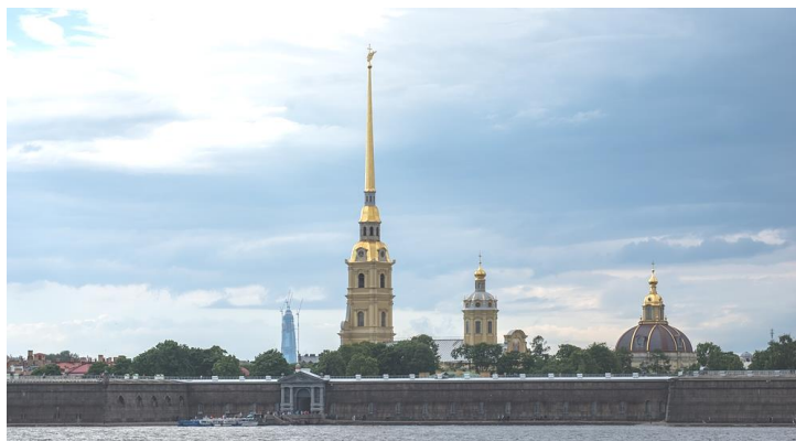
Fig. 3. Lakhta Center Building in the historical panorama of the Peter and Paul Fortress

The location of a new object in the visual area of an ensemble is often observed in historical parts of cities. In Saint Petersburg, cases of architectural and urban-planning violations, related to the introduction of high-rise dominants into the environment of historical river panoramas, are observed [10]. Here, results of the unscientific approach to solving the complex problem of combination of “new” and “old” are much in evidence. A typical example is the appearance of the Lakhta Center building within the historical river panorama of the Peter and Paul Fortress [11]. The building is located at a considerable distance from the historical part of the city, and, due to its height (462 m), it can be viewed from various points of the city center (Figure 3).