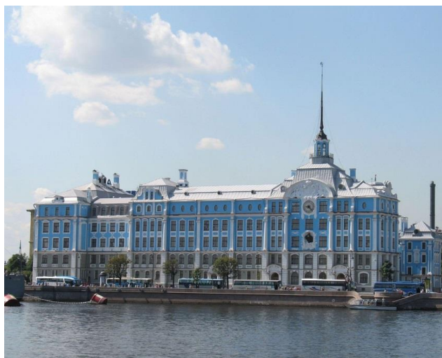
Fig. 7. School House building

Replication of a unique technique in new high-rise construction is presented in the architecture of the Aurora residential house. It is a technique, widespread in the modern practice, allowing to join new and old by repeating some forms of a “historical neighbor” in a new building [13]. However, this technique leads to the opposite result: the architectural significance of the historical object is reduced. The crowning tower of this large high-rise building clearly reminds the cupola-spire top of the School House (Figure 7). This large-scale “look-alike” makes the low historical building to seem even lower and the role of one of the dominants of the Neva panorama is reduced practically to zero [1].