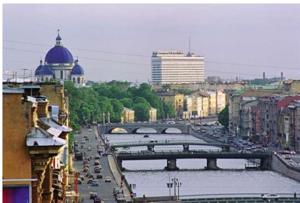
Fig. 2. Sovietskaya hotel in the Fontanka River panorama

Two years earlier in Leningrad, first high-rise facilities, i.e. Sovietskaya and Leningrad hotels, were built by the 50 th anniversary of the Great October Socialist Revolution [2]; with their rectangular forms, they were the first to violate the skyline of the city’s historical part (Figure 2). The construction of these facilities laid the foundation for high-rise construction both in the historical urban nucleus and in close proximity to the historical center.