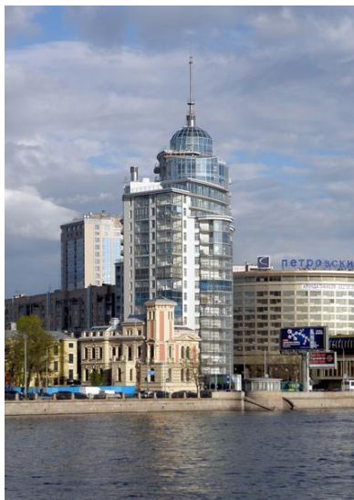
Fig. 6. Aurora residential complex

suppressed by large-scale forms of the high-rise structure located on the opposite bank of the Neva river.