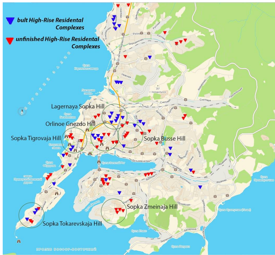
Fig.1. Layout of high-rise residential complexes in the city of Vladivostok

The authors investigated the conditions of all high-rise residential sites in the city of Vladivostok It has been identified that the majority of high-rise residential sites are located in the central part of the city of Vladivostok on slopes up to 30% at the top elevations of the relief (figure 1).