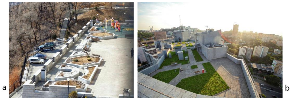
Fig.3. Examples of area landscaping of high-rise residential apartment buildings in the city of Vladivostok: a – Orlinoe Gnezdo-I , b – Armada

The reasons why the regulatory requirements for greening of high-rise residential sites on steep hills are not observed have been identified as the following: the failure to comply federal and local construction rules with the features of steep slopes greening - the current standards do not consider green roofs and green walls as a landscaping facility of compensatory nature; the disturbance of the relief leads to the disturbance of soil cover on dumps and slopes, the destruction of primary plant groupings, the changes in the dynamics of plant communities. Single examples of the use of green roofs have been identified (figure 3).